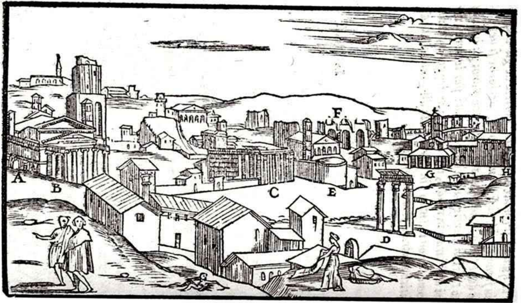
Image: Bernardo Gamucci, woodcut from Le Antichita della Citta di Roma... In Venegia: 1588 (179- 662q). We want to see your masterpiece! Share your work on Twitter or Instagram. @FolgerLibrary #ColourourCollections