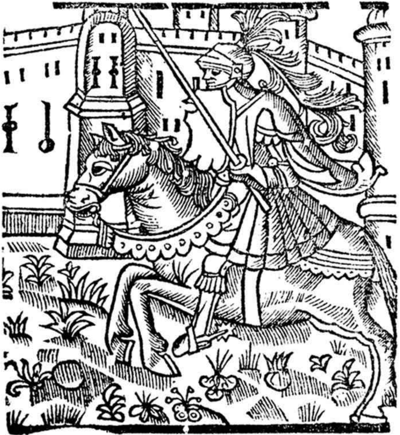
Image: Woodcut from The VVorkes of Our Ancient and Learned English Poet, Geffrey Chaucer, Newly Printed . 1602 (STC 5080 copy 1) We want to see your work on Twitter or Instagram! @FolgerLibrary #ColourourCollections