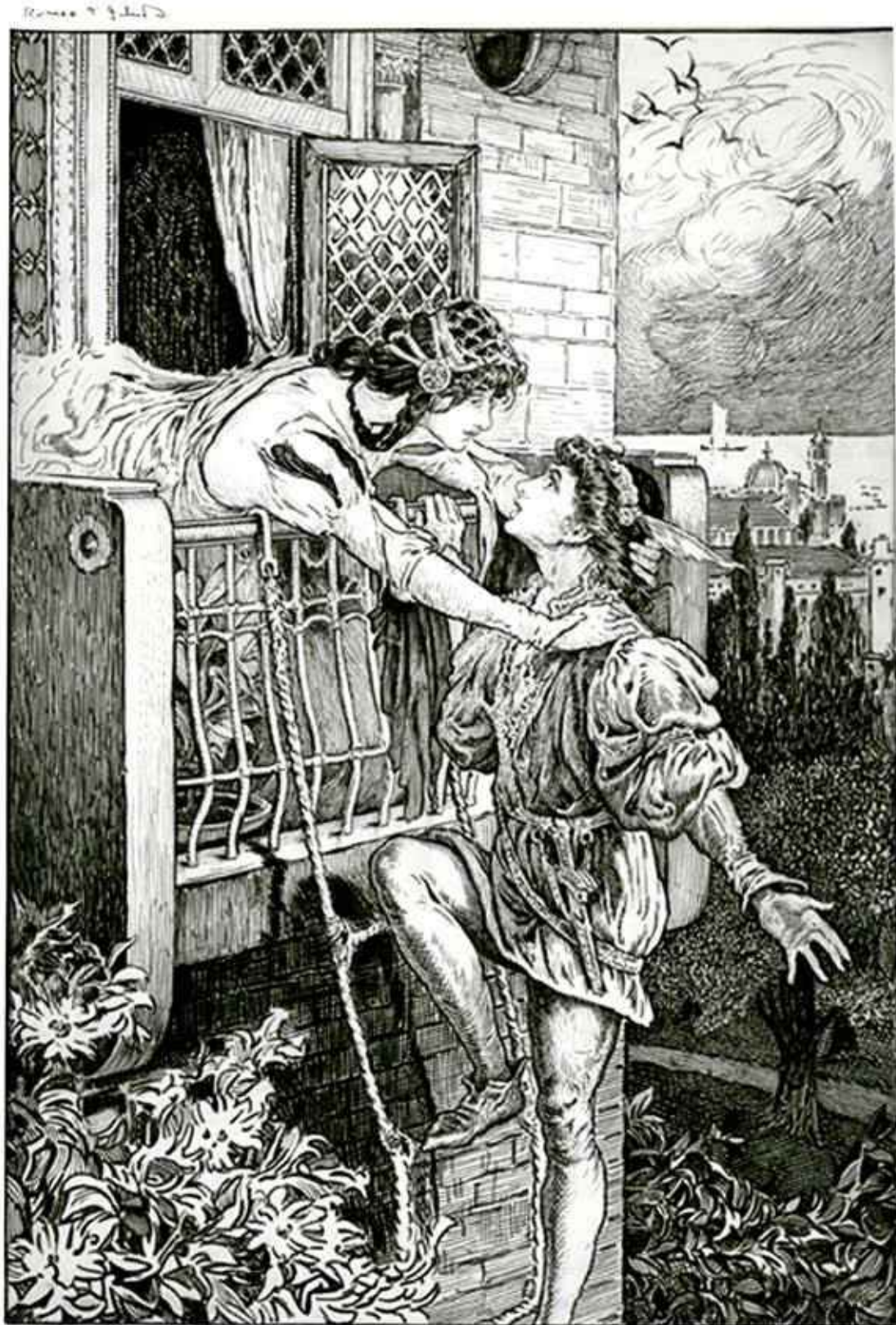
Image: Louis Rhead, pen and ink drawing: "Romeo & Juliet, I must begone and live, or stay and die," for Charles and Mary Lamb's Tales from Shakespeare . Before 1918 (ART Box R469 no.101 (size L)) Share your coloring with us on Twitter and Instagram! @FolgerLibrary #ColourCollections