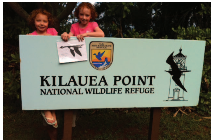
Barrett Elementary School