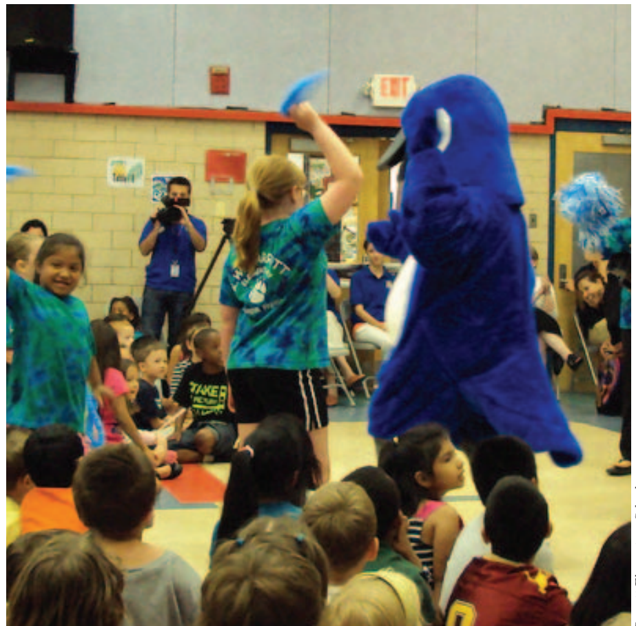
Barrett Elementary School