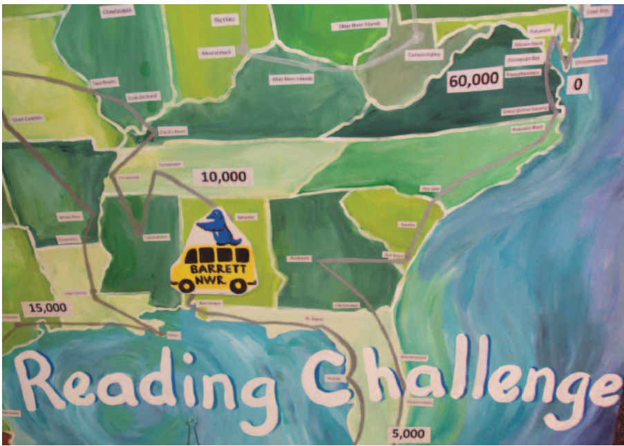
Barrett Elementary School

On a giant map of the United States, Puddles “drove” a school bus through several states every time the children read another 5,000 books. Reading is the fuel for the bus to pass by more and more national wildlife refuges.