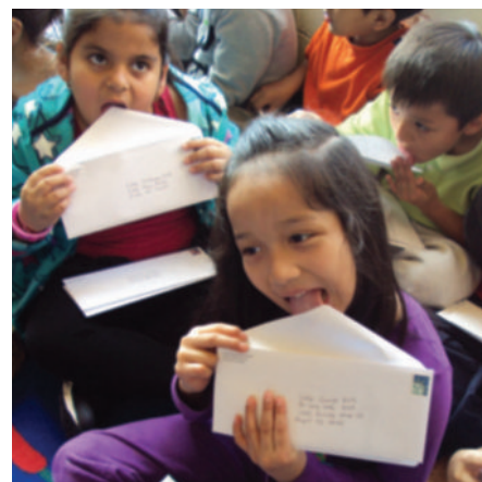
Barrett Elementary School