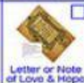
Letter or Note of Love & Hope

You may need to survive on your own after an emergency. This means having your own food, water, and other supplies in sufficient quantity to last for at least three days. Local officials and relief workers will be on the scene after a disaster, but they cannot reach everyone immediately. You could get help in hours, or it might take days. In addition, basic services such as electricity, gas, water, sewage treatment, and telephones may be cut off for days, or even a week or longer. Ready America