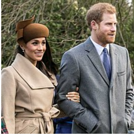
Harry and Meghan attending church on Christmas Day 2017

grounds of Kensington Palace following their marriage. [8]