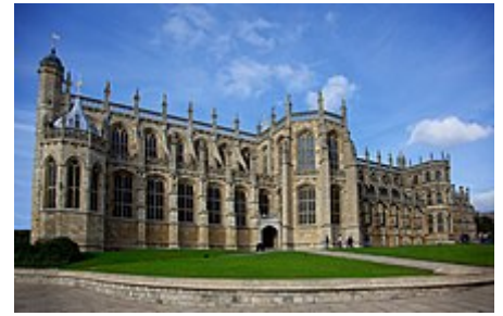
St George's Chapel, Windsor

The royal family have announced that they will pay for the wedding. [37] The costs for the cake, the florist, and the catering have been estimated to be £50,000, £110,000, and £286,000 respectively, [38] and the overall cost is expected to be around £32 million. [39] The security costs are expected to be lower than those of the 2011 wedding of the Duke and Duchess of Cambridge. [40] The Royal Borough of Windsor and Maidenhead has reportedly spent £2.6 million on cleaning the town and roads. [40] It has been predicted that the wedding will trigger a tourism boom and boost the economy by up to £500 million. [41]