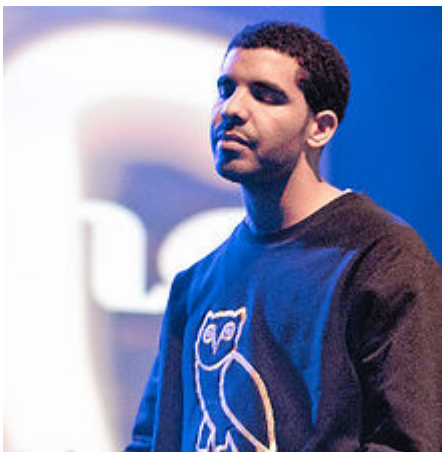
Drake during a performance in Toronto in 2011

Prior to the album's release, Drake planned to record a collaborative album with Lil Wayne ; however, it was ultimately scrapped due to the success of Watch the Throne . [100][101][102] He also began collaborations with Rick Ross for a mixtape titled Y.O.L.O. , but the duo decided against the project in favor of increased concern for their respective studio albums. [103][104]