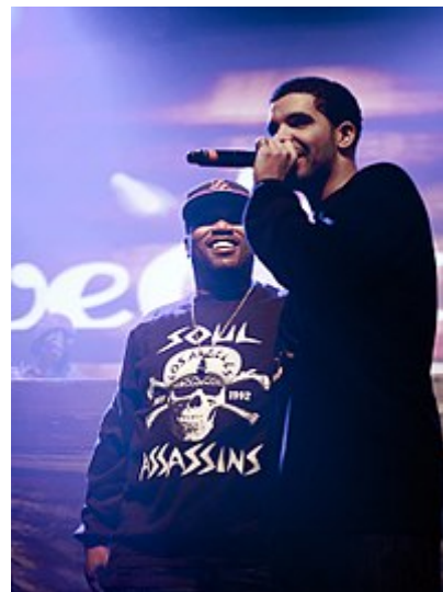
Drake performing alongside Bun B in 2011.