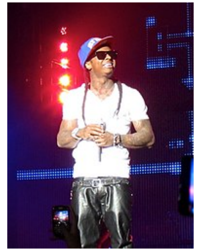
Lil Wayne, the founder of Young Money Entertainment, would sign Drake to the label in 2009. [47]

After becoming musically inspired by Jay-Z and Clipse , Drake self-released his debut mixtape, Room for Improvement , in 2006. The mixtape featured Trey Songz and Lupe Fiasco , and included vast production from Canadian producers Boi-1da and Frank Dukes . When asked about the mixtape, Drake described the project as "pretty straightforward, radio friendly, [and] not much content to it." The mixtape was released for sale only and sold over 6,000 copies. [45] In 2007, he released his second mixtape Comeback Season . Released from his recently founded October's Very Own label, it spawned the single "Replacement Girl" featuring Trey Songz . The song made Drake become the first ever unsigned Canadian rapper to have his music video featured on BET , with "Replacement Girl" being featured on the channel's "New Joint of the Day" segment on April 30, 2007. [48] The song also saw Drake sample "Man of the Year" by Brisco , Flo Rida and Lil Wayne , retaining Lil Wayne's verse, and adjoined his own to the song's earlier half. This caused Jas Prince to gift Lil Wayne the song, which prompted the rapper to invite Drake to Houston to join his Tha Carter III tour. [49] Throughout the duration of the tour, Drake and Lil Wayne recorded multiple songs together, including "Ransom", "Forever", and a remix to "Brand New". [49] Despite the collaborations between the duo, Drake was yet to be signed by Young Money Entertainment .