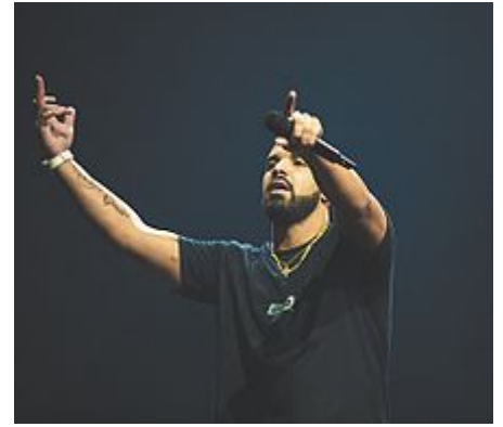
Drake performing at the Summer Sixteen Tour in Toronto in 2016.