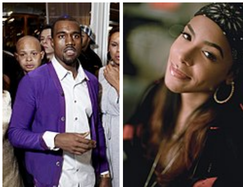
Drake has credited Kanye West (left) and Aaliyah (right) as being his biggest musical influences.

While Drake's earlier music primarily spanned hip hop and R&B , his music has delved into pop and trap in recent years. [272] Additionally, his music has drawn influence from regional scenes, including Jamaica's dancehall [270] and UK drill . [250] Drake is known for his egotistical lyrics, technical ability, and integration of personal backstory when dealing with relationships with women. [273] His vocal abilities have been lauded for an audible contrast between typical hip-hop beats and melody, with sometimes abrasive rapping coupled with softer accents, delivered on technical lyricism. [274] His songs often include audible changes in lyrical pronunciation in parallel with his upbringing in Toronto, and connections with Caribbean and Middle Eastern countries which include such phrases as "ting", "touching road", "talkin' boasy" and "gwanin' wassy". [274] Most of his songs contain R&B and Canadian hip hop elements, and he combines rapping with singing. [275] He credits his father with the introduction of singing into his rap mixtapes, which have become a staple in his musical repertoire. His incorporation of melody into technically complex lyrics was supported by Lil Wayne , and has subsequently been a critically acclaimed component to Drake's singles and albums. [276]