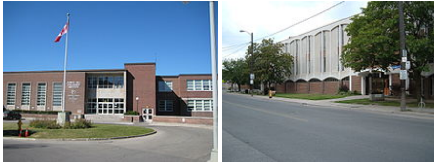
Drake attended both Forest Hill Collegiate Institute (left) and Vaughan Road Academy (right) during high school.