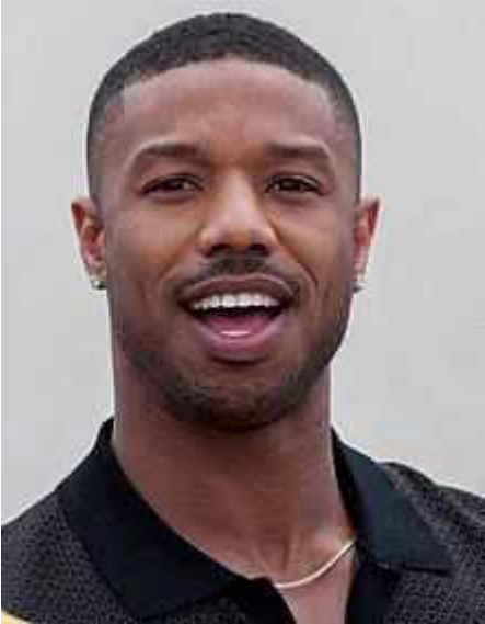
Jordan at the 2018 Cannes Film Festival