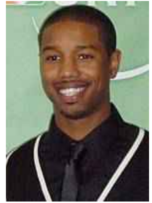
Jordan in 2011

Jordan worked as a child model for several companies and brands, including Modell's sporting goods and Toys "R" Us, before deciding to embark on a career as an actor. [10][11] He launched his career as a professional actor in 1999, when he appeared briefly in single episodes of the television series Cosby and The Sopranos . [8] His first principal film role followed in 2001 when he was featured in Hardball , which starred Keanu Reeves. In 2002, he gained more attention by playing the small but pivotal role of Wallace in the first season of HBO's The Wire . In March 2003, he joined the cast of All My Children playing Reggie Montgomery replacing Chadwick Boseman, a troubled teenager, until June 2006 when Jordan was released from his contract. [12] Jordan's other credits include guest starring appearances on CSI: Crime Scene Investigation , [13] Without a Trace and Cold Case . Thereafter, he had a lead role in the independent film Blackout and starred in The Assistants on The-N. In 2008, Jordan appeared in the music video "Did You Wrong" by R&B artist Pleasure P. In 2009, he guest-starred on Burn Notice in the episode "Hot Spot", playing a high school football player who got into a fight and is being hunted by a local gangster. In 2010, he guest-starred in the Law & Order: Criminal Intent episode "Inhumane Society" as a boxer involved in a Michael Vick-inspired dog fighting scandal.