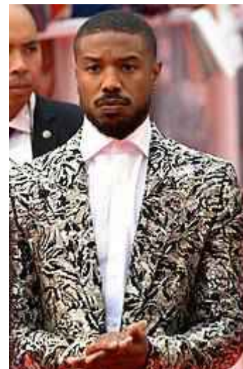
Jordan at the 2019 Toronto International Film Festival