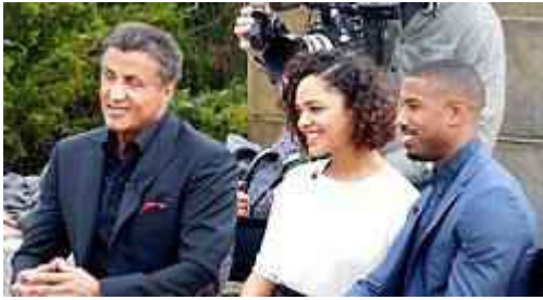
Jordan alongside Sylvester Stallone and Tessa Thompson promoting Creed in November 2015