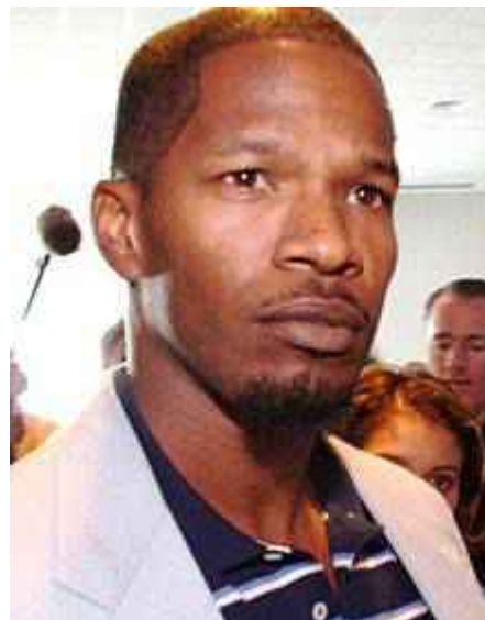
Foxx in 2005