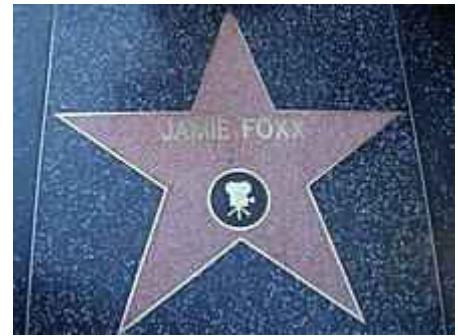
Foxx's star on the Hollywood Walk of Fame

Foxx released his third album titled Intuition in 2008, featuring Kanye West, T.I., Ne-Yo, Lil' Kim and T-Pain. The album's first single, "Just Like Me" featuring T.I., was promoted by a video directed by Brett Ratner which featured an appearance by actress Taraji P. Henson. The second single "Blame It" featured T-Pain and became a top 5 single on the Billboard Hot 100 and a number-one single on the Billboard Hot R&B/Hip-Hop Songs chart. The "Blame It" music video, directed by Hype Williams, features cameo appearances by Forest Whitaker, Samuel L. Jackson, Ron Howard, Quincy Jones and his Jarhead co-star Jake Gyllenhaal, amongst others.