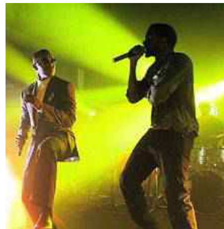
Foxx and Kanye West performing "Gold Digger"

Foxx would also portray Ray Charles in the biographical film Ray (2004), for which he won the Academy Award for Best Actor [5] and the BAFTA Award for Best Actor in a Leading Role. Foxx is the third male in history (after Barry Fitzgerald and Al Pacino) to receive two acting Oscar nominations in the same year for two different movies, Collateral and Ray . In 2005, Foxx was invited to join the Academy of Motion Picture Arts and Sciences. [16]