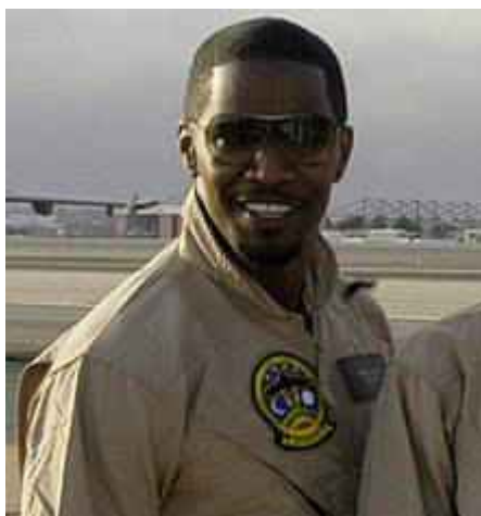
Foxx promoting Stealth in July 2005.

Foxx released his second studio album, Unpredictable , in December 2005. It debuted at #2, selling 598,000 copies in its first week, [17] rising to #1 the following week and selling an additional 200,000 copies. [18] To date, the album has sold 1.98 million copies in the United States, and was certified double Platinum by the RIAA. [19][20] The album also charted on the UK Albums Chart, where it peaked at #9. [21] Foxx became the fourth artist to have both won an Academy Award for an acting role and to have achieved a #1 album in the U.S, joining Frank Sinatra, Bing Crosby and Barbra Streisand. Foxx's first single from the album, the title track "Unpredictable" (featuring Ludacris), peaked in the Billboard Hot 100 Top 10 singles and also made the UK Top 20 singles chart; the track samples "Wildflower" by New Birth. The second US single from the album was "DJ Play a Love Song," which reunited Foxx with Twista. In the UK, the second single was "Extravaganza", which saw Foxx once again collaborate with Kanye West, although Foxx did not feature in the song's music video.