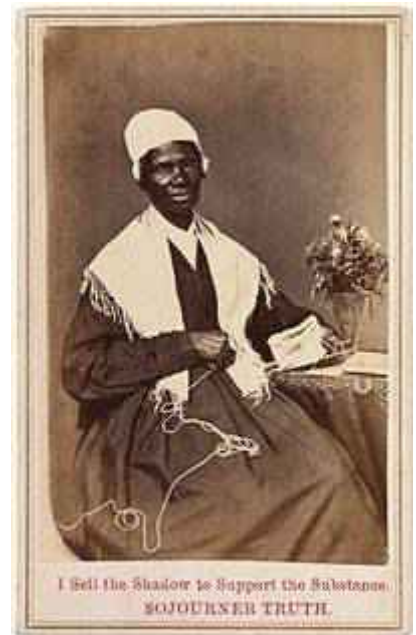
Truth's carte de visite, which she sold to raise money (see inscription).

Truth spoke about abolition, women's rights, prison reform, and preached to the Michigan Legislature against capital punishment. Not everyone welcomed her preaching and lectures, but she had many friends and staunch support among many influential people at the time, including Amy Post , Parker Pillsbury , Frances Gage , Wendell Phillips , William Lloyd Garrison , Laura Smith Haviland , Lucretia Mott , Ellen G. White , and Susan B. Anthony . [31]