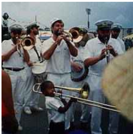
Trombone Shorty at age five, with the Carlsberg Brass Band, New Orleans Jazz & Heritage Festival, 1991

Andrews performed on "Where Y'At" as part of the Sixth Ward All-Star Brass Band Revue featuring Charles Neville of The Neville Brothers .