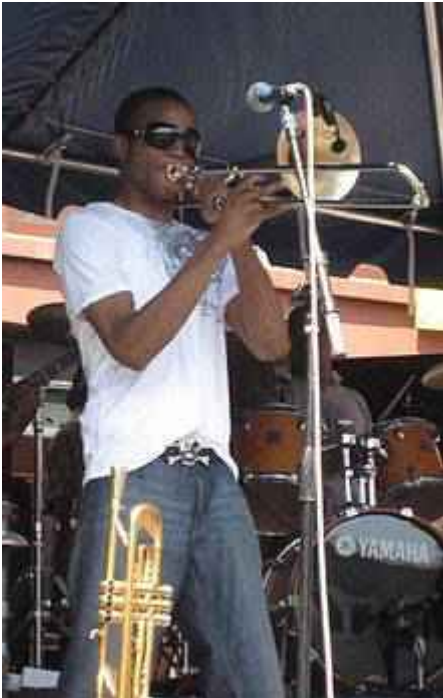
At the Satchmo SummerFest, August 2007