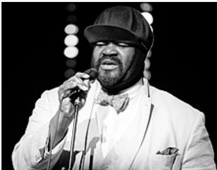
Porter performing at the 2018 Kongsberg Jazzfestival