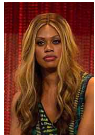
Laverne Cox at PaleyFest 2014 representing Orange is the New Black .

News outlets such as Salon , The Huffington Post , and Business Insider covered what was characterized by Salon writer Katie McDonough as Couric's "clueless" and "invasive" line of questioning. [37]