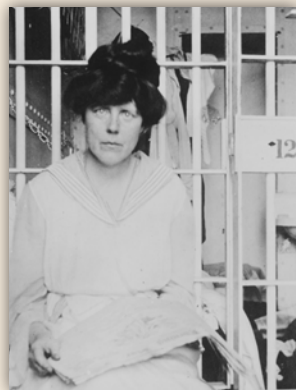
Lucy Burns locked up at Occoquan Workhouse Lorton, VA.