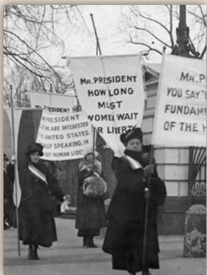
Suffragists protesting at the White House

The Jail Door pin is now a symbol of women's fight for equal rights.