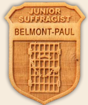
The Junior Suffragist pin with the Jailhouse door