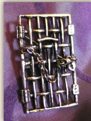
A Jailhouse door pin