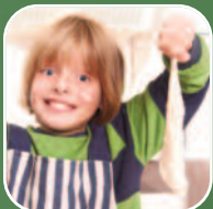
When preparing food