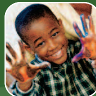
When hands are dirty