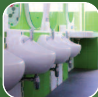
After using the restroom