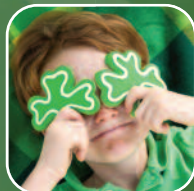
Before snacks and meals