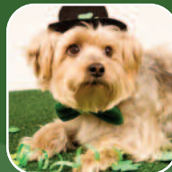
After touching animals