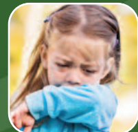
When you or someone around you is ill