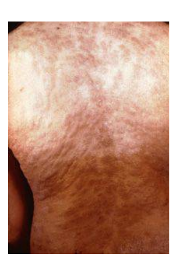
Secondary rash from syphilis on torso.

During the secondary stage, you may have skin rashes and/or mucous membrane lesions. Mucous membrane lesions are sores in your mouth, vagina, or anus. This stage usually starts with a rash on one or more areas of your body. The rash can show up when your primary sore is healing or several weeks after the sore has healed. The rash can look like rough, red, or reddish brown spots on the palms of your hands and/or the bottoms of your feet. The rash usually won't itch and it is sometimes so faint that you won't notice it. Other symptoms you may have can include fever, swollen lymph glands, sore throat, patchy hair loss, headaches, weight loss, muscle aches, and fatigue (feeling very tired). The