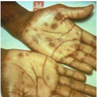
Secondary rash from syphilis on palms of hands.