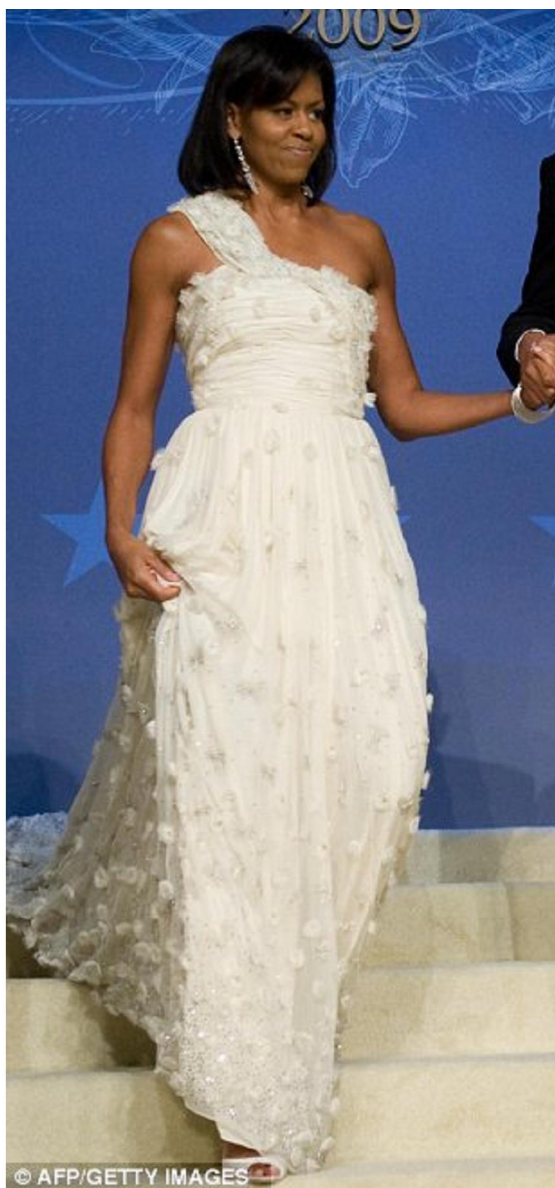
Michelle Obama wore a white one-shoulder gown by young designer Jason Wu for a ball in 2009 to celebrate her husband's inauguration. It is now part of a new display of first ladies' debut dresses at the Smithsonian

In addition to Mrs Obama's Jason Wu dress, gowns worn by Mamie Eisenhower, Betty Ford, Barbara Bush and Nancy Reagan, as well as the more recent Hillary Clinton, form part of the exhibit.