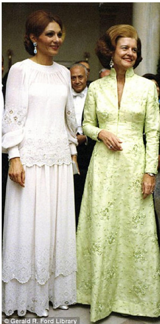
As there was no formal inaugural event in 1975, Betty Ford made her debut instead at a State Dinner at the White House for the Shah of Iran in 1975. Pictured in the gown (right) at a State Dinner with his wife Farah

Her decision to re-use an old dress sparked media debate about the first lady's responsibility to the American fashion industry, the symbolism of an inaugural gown, and Americans' desire for glamour in the White House.