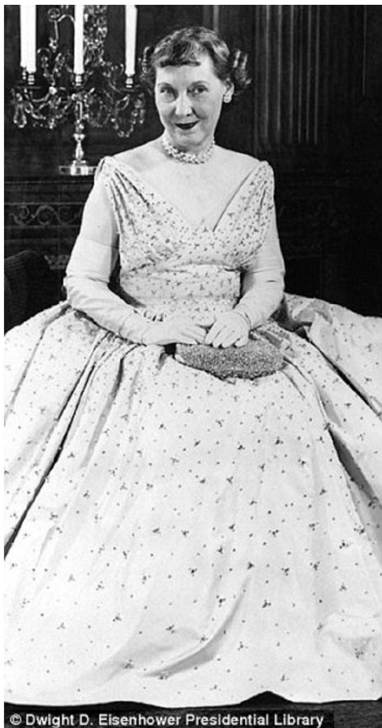
One of the most lavish gowns was Mamie Eisenhower's for the 1953 inaugural balls. She wore a Nettie Rosenstein design which boasted over 2,000 rhinestones stitched into the pale pink peau de soie