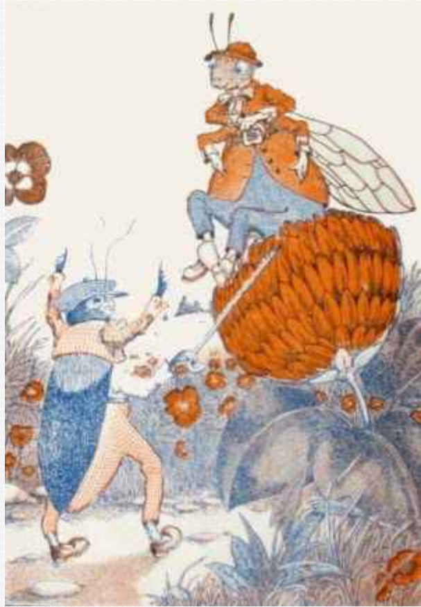
Buster Bumblebee and Chirpy Cricket Have A Chat. Frontispiece —