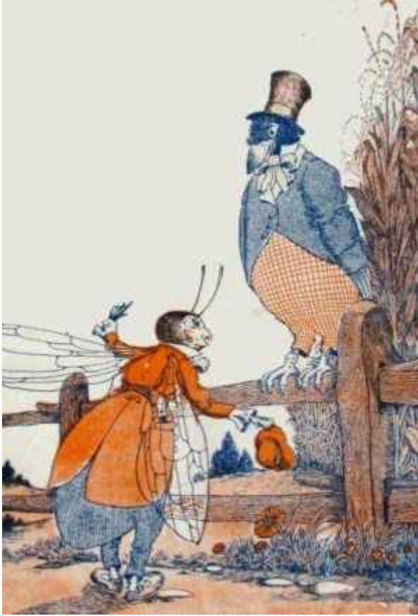
Buster Thanks Old Mr. Crow For His Advice.