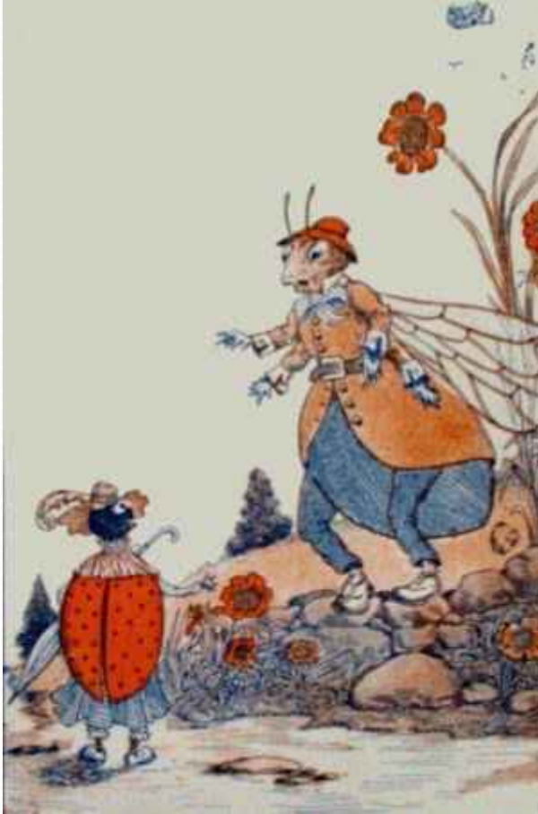
Buster Listened to Mrs. Ladybug's Suggestion.