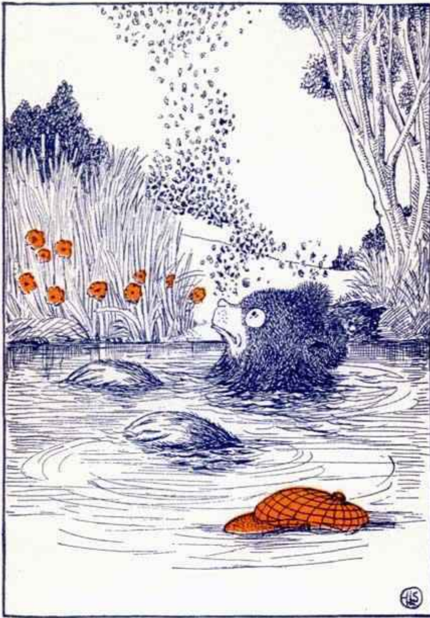
The Bees Were Right