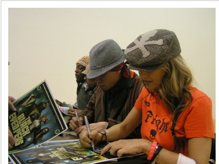
The Black Eyed Peas signing autographs in 2004.