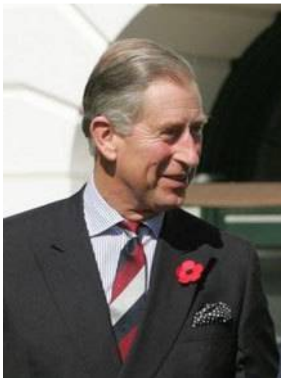
Prince Charles, the Prince of Wales

Prince Charles, who was born at Buckingham Palace on 14 November 1948, is the eldest son of Elizabeth II and Prince Philip, Duke of Edinburgh. He is the heir to the throne of the United Kingdom. The Prince of Wales is well known for his extensive charity work, particularly for the Prince's Trust. He also carries out a full schedule of royal duties, and increasingly is taking on more royal roles from his aging mother. The Prince is also well known for his high profile marriages to the late Lady Diana Spencer and subsequently to Camilla, The Duchess of Cornwall.