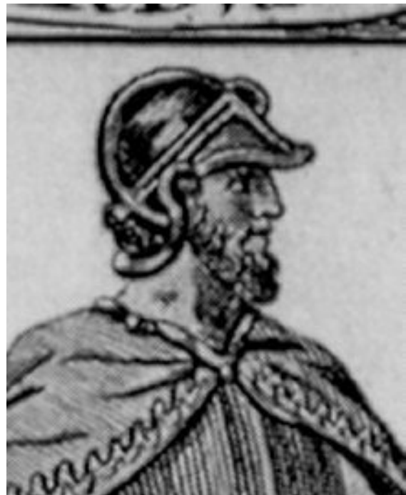
Artist's impression of Edward the Elder