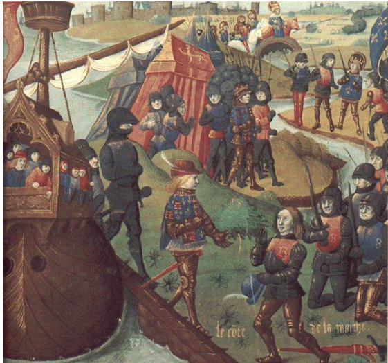
Henry III lands in Aquitaine, as shown in a 15th century from a later illumination.

Henry was extremely religious, and his journeys were often delayed by his insistence on hearing Mass several times a day. He was also much taken with the cult of the Anglo-Saxon King Edward the Confessor who had been made a saint in 1161. Told that St Edward dressed austere, Henry did the same and wore only the simplest of robes. He had a mural of the saint painted in his bed-chamber for inspiration before and after sleep, and named his eldest son after him. Henry designated Westminster, where St Edward had founded the abbey, as the fixed seat of power in England. Westminster Hall duly became the greatest ceremonial space of the kingdom, where the council of nobles also met. Henry appointed French architects to renovate Westminster Abbey in Gothic style, and work began at great expense in 1245. The centrepiece at the renovated Abbey was a shrine to Edward.