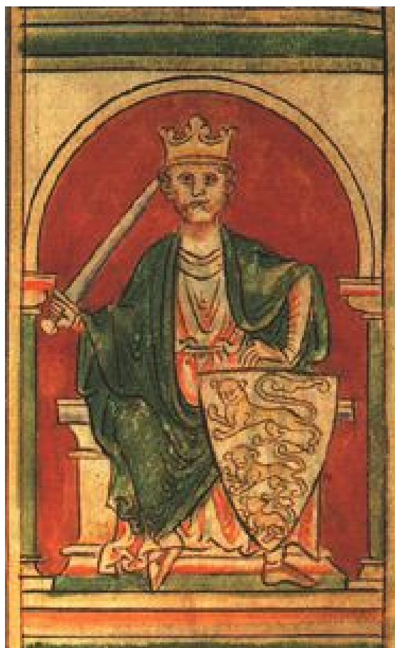
Richard the Lionheart

His father, Henry, made him Duke of Aquitaine in 1168, and of Poitiers in 1172. He therefore learned to defend