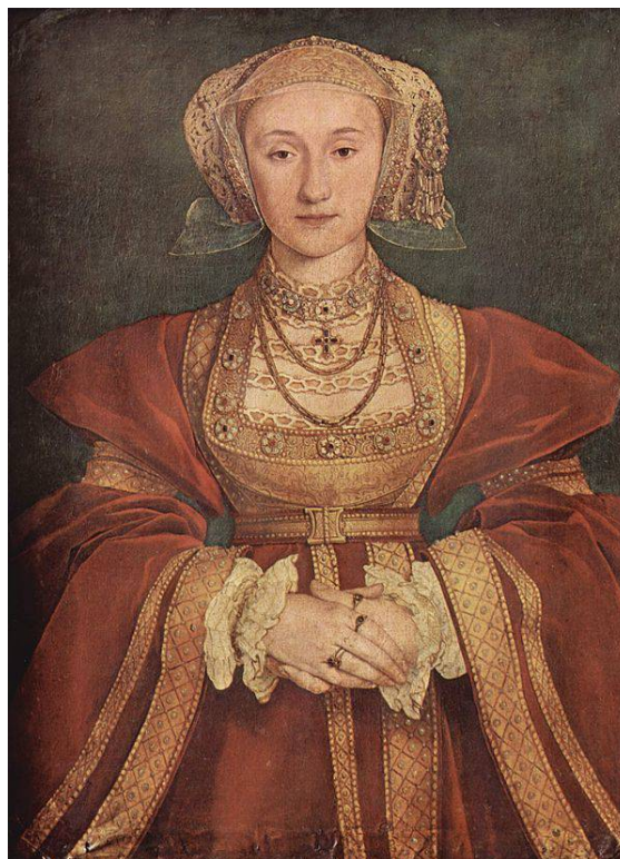
Henry was shown the above picture of Anne of Cleves.

Henry's only surviving son, Edward, was not a healthy child. Therefore, Henry wanted to marry again to ensure that a male could succeed him. Thomas Cromwell sug-