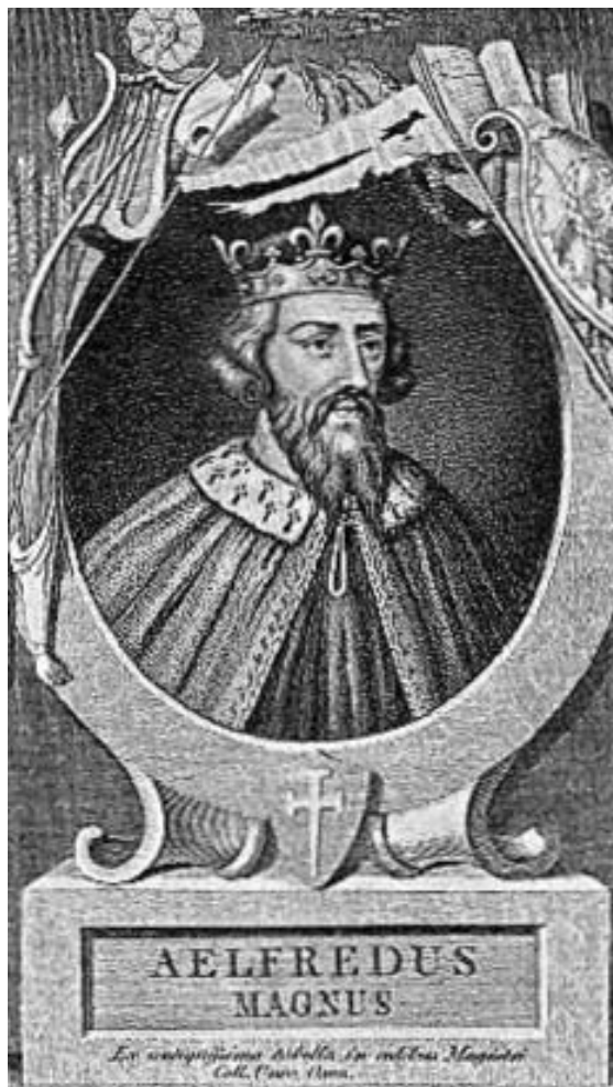
King Alfred the Great

Alfred the Great was born around 850 in Wantage, in what is now Oxfordshire. Alfred was the fourth son of King Ethelwulf of Wessex. He became king of the southern Anglo-Saxon kingdom of Wessex in 871, when his