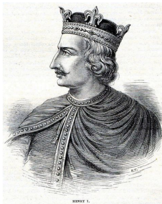
Henry I depicted in Cassell's History of England (1902)

In 1101, a year after Henry became king, his older brother, Robert, invaded England in an attempt to become king. They agreed a peace in the Treaty of Alton, in which Robert accepted Henry as King of England and returned peacefully to Normandy. In return Henry agreed to pay Robert 2000 marks each year. Four years later, though, Henry took an army across the English Channel. In 1106, he defeated his brother's Norman army decisively at Battle of Tinchebray. He imprisoned his brother Robert, and claimed the Duchy of Normandy as a possession of England, as a result reuniting his father's lands.