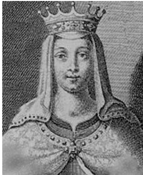
Empress Matilda (or Maud)

Empress Maud is the title by which Matilda , the only daughter and second child of King Henry I of England,