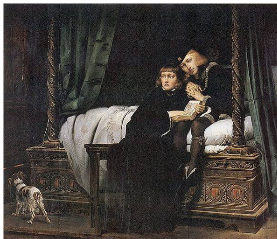
King Edward V and the Duke of York in the Tower of London

Edward V was born in sanctuary within Westminster Abbey on 4 November 1470, while his mother was tak-