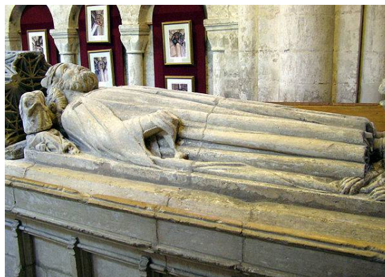
The tomb of King Athelstan in Malmesbury Abbey. There is nothing in the tomb beneath the statue, the relics of the king having been lost in the Dissolution of the Monasteries in 1539.

Athelstan was born around the year 895 and became king, first of Mercia, in 924 and then of Wessex in 925. He was the son of King Edward the Elder. Political alliances were high on Athelstan's agenda. A year after becoming king, he had a sister married to Sihtric, the Viking King of York. Sihtric died a year later, and Athelstan took the chance to capture Northumbria. This was a bold move, and made him the king of a larger territory than any Anglo-Saxon king before him, roughly equivalent to modern England, except for Cornwall. The rulers of the territories neighbouring Athelstan's then appear to have submitted to him at Bamburgh. The Anglo-Saxon Chronicle noted that these included "Hywel, King of the West Welsh [that is, the Cornish], and Constantine II, King of Scots, and Owain, King of the people of Gwent,