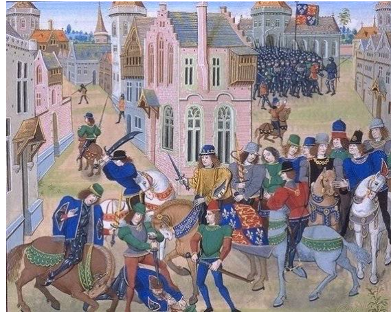
Richard II watches Wat Tyler's death and addresses the peasants in the background

John of Gaunt, his uncle, ruled on Richard's behalf for the first years of his reign and it was the Peasants' Revolt of 1381 that brought Richard into the limelight. It fell to him personally to negotiate with Wat Tyler and the