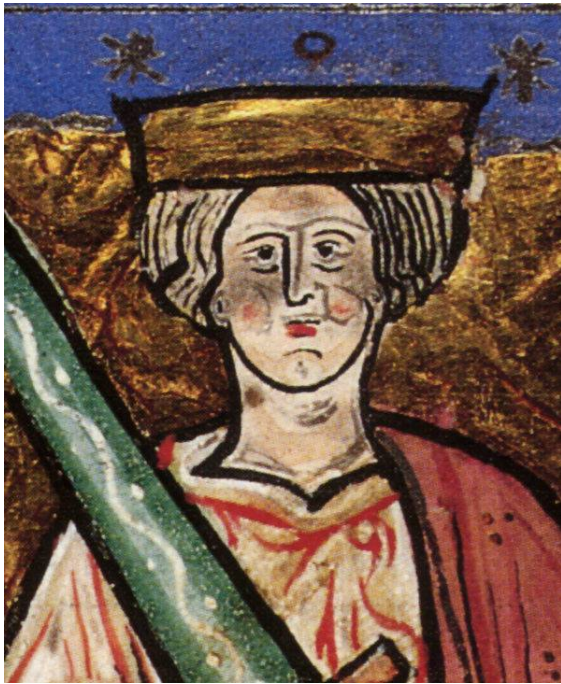
Ethelred the Unready

Ethelred the Unready was born around the year 968 in Wessex and died in 1016. He was King of England between 978 and 1013, and then again between 1014 and 1016. He is also known as King Ethelred II. His nickname “The Unready” does not mean that he was ill-prepared, but comes from the Anglo-Saxon unræd meaning “without counsel” or “indecisive”. This could also be interpreted as a pun on his name, Æðelræd , which may be understood to mean “noble counsel”. Ethelred became king when he was aged about 10 after the death of his father, King Edgar, and the murder of his half-brother King Edward.