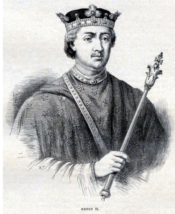
King Henry II

Henry II was born on 5 March 1133 in Le Mans. He ruled as Count of Anjou, Duke of Normandy and as King of England from 1154 until his death in 1189. Following the disputed reign of King Stephen, Henry's reign saw efficient consolidation. Henry II has a reputation as one of England's greatest medieval kings. At various times he controlled parts of Wales, Scotland, eastern Ireland, and western France. He was the first of the Plantagenet or Angevin Kings. Before becoming king Henry already controlled Normandy and Anjou. Whilst king, he had an empire, known as the Angevin Empire, that stretched from the Solway Firth almost to the Mediterranean and from the Somme to the Pyrenees. His mother was Empress Matilda, and his father was her second husband, Geoffrey of Anjou. He was brought up in Anjou, which is where the name Angevin comes from, though he visited England in 1149 to help his mother with her claim to the English throne.