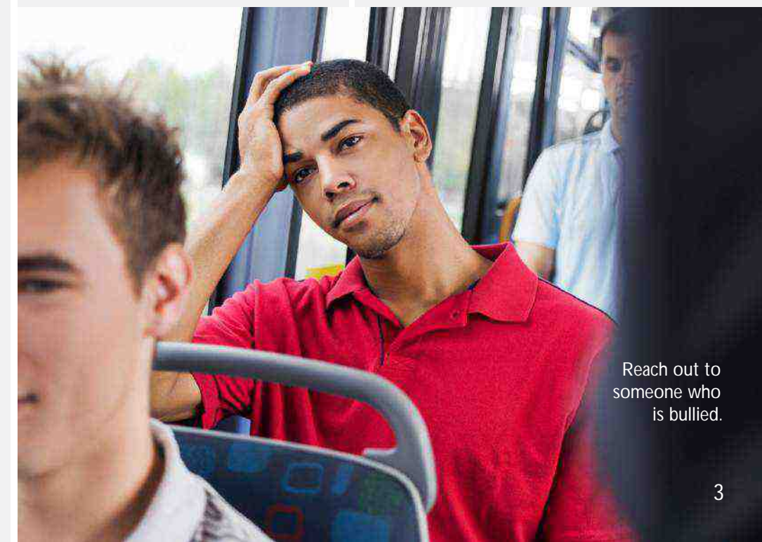
Reach out to someone who is bullied.

Photos: gifs, © omgimages/Thinkstock; highlighted "Bullying," © Devonyu/Thinkstock; people on bus, © skynesher/Stockphoto; people icons, © Azaze110r/Stockphoto.