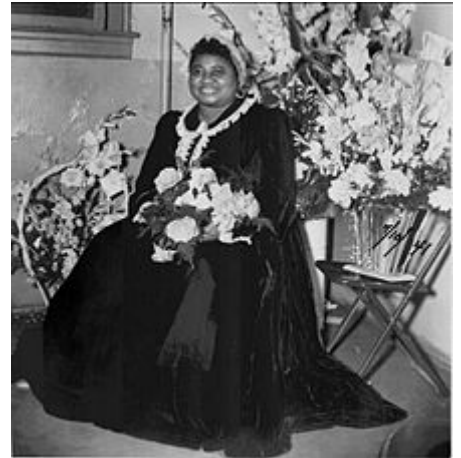
Hattie McDaniel was the first African American to win an Academy Award, in 1939.

This list of black Academy Award winners and nominees is current as of the 91st Academy Awards ceremony which was held on February 24, 2019.