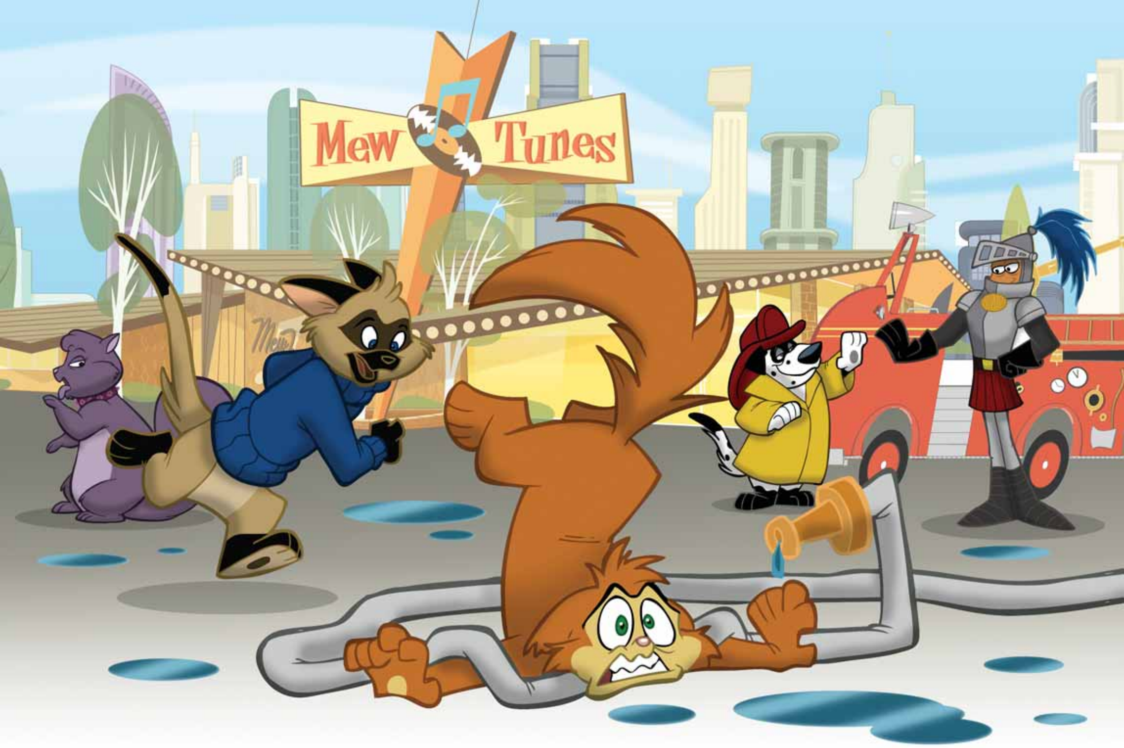
Whew! That was a close one!