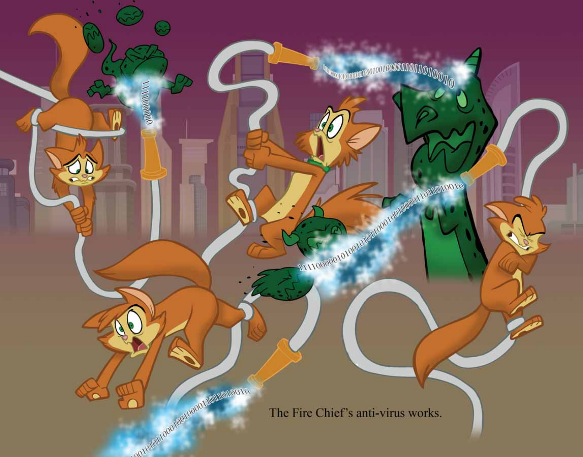
The Fire Chief's anti-virus works.