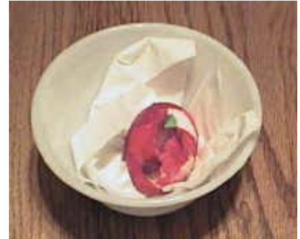
photo of the egg after the paper has fallen off

Bright, new tissue paper works the best.