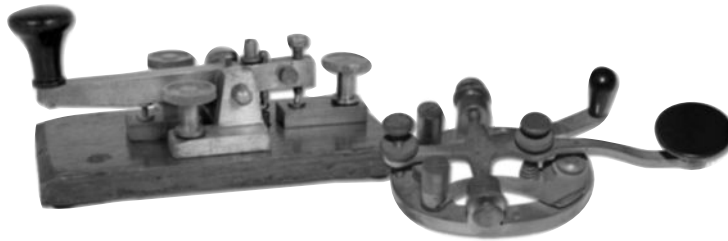
British Post Office Morse Code Key & a railroad telegraph machine