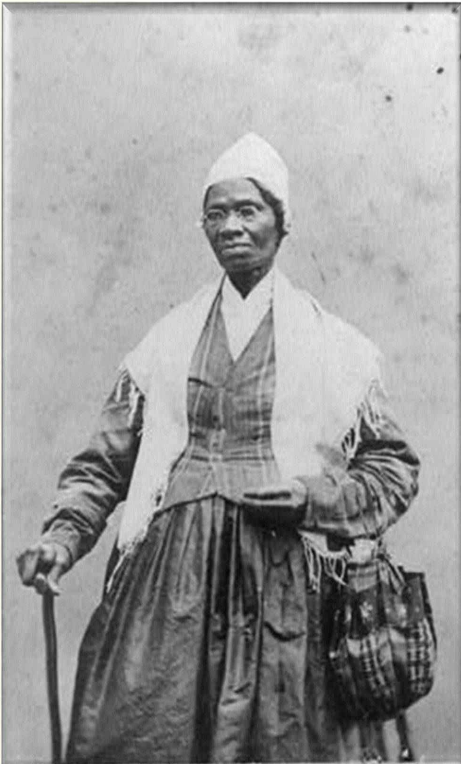
I WELLED THE SHADOW TO SUPPORT THE SUBSTANCE. SOJOURNER TRUTH.