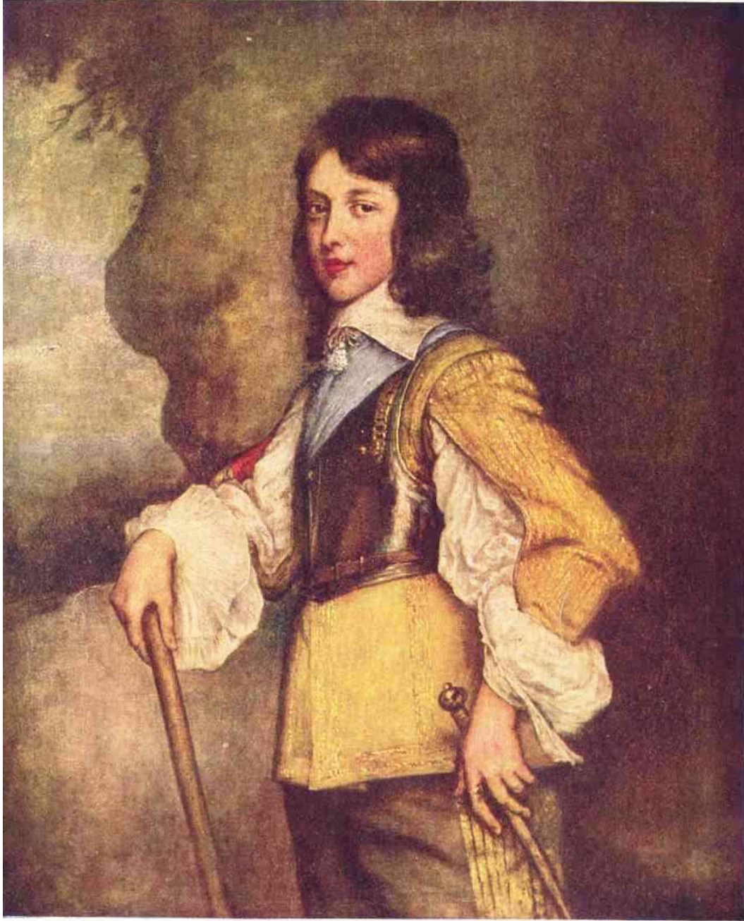
WILLIAM II. OF ORANGE

From the picture by Van Dyck, in the Hermitage Gallery, Leningrad