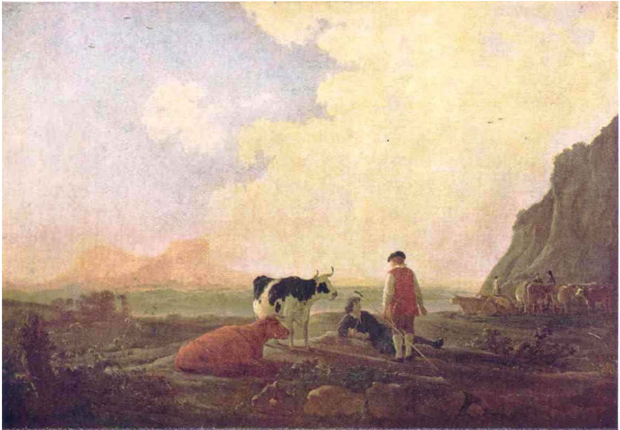
LANDSCAPE WITH CATTLE From the picture by Cuyp, in the Dulwich Gallery

distance and a great hill in the foreground. It is certainly not a view that Cuyp ever saw in Holland with his own eyes. He thought that the mountain's upright lines were good to break the flatness; and the finished composition, if beautiful, is its own excuse for being.