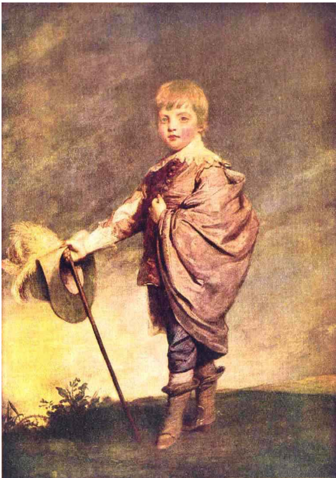
THE DUKE OF GLOUCESTER

From the picture by Sir Joshua Reynolds, in Trinity College, Cambridge