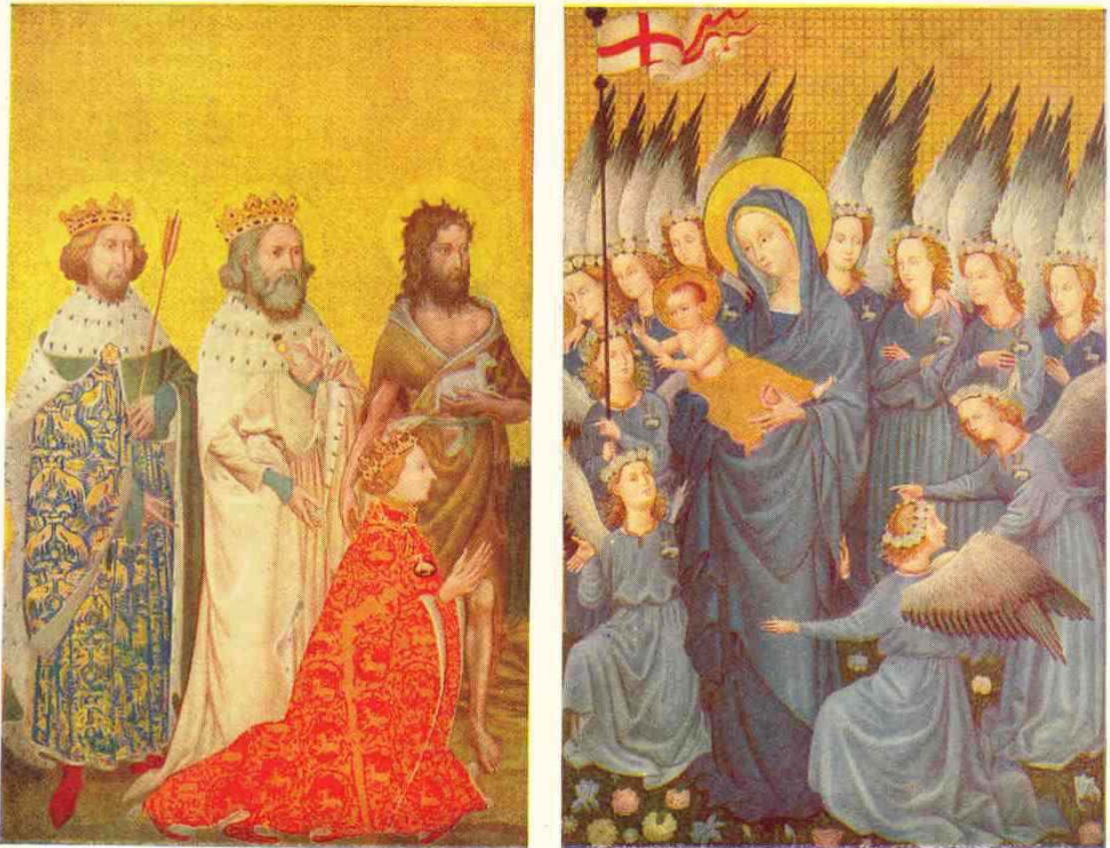
RICHARD II. BEFORE THE VIRGIN AND CHILD From a picture by an unknown artist in the Wilton House Collection

canonized for his sanctity and who points to Richard II. as his spiritual successor upon the throne. In medieval art the saints are distinguished by their emblems, which often have an association with the grim way in which they met their death, or with some other prominent feature in their legend. Here Edward holds up a ring, whereof a pretty story is told. Edward once took it off his finger to give it to a beggar, because he had no money with him. But the beggar was no other than John the Evangelist in disguise, and two years later he sent the ring back to the King with the message that in six months Edward would be in the joy of heaven with him. William Caxton, the first English printer, relates in his life of King Edward that when he heard the message he was full of joy and let fall tears from his eyes, giving praise and thanksgiving to Almighty God.