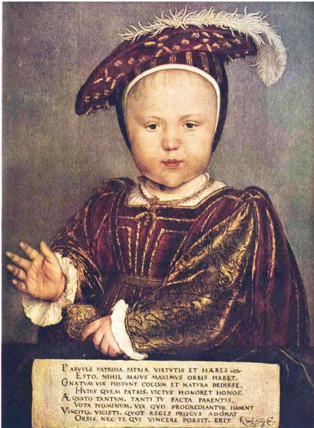
EDWARD, PRINCE OF WALES, AFTERWARDS EDWARD VI. From the picture by Holbein, in the Collection of the Earl of Yarborough, London

If you recall for a moment what you know of Henry VIII., his masterful pride, his magnificence, his determination to do and have exactly what he wanted, you will understand that his demands upon his court painter for a portrait of his only son and heir must have been high. No one could