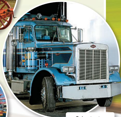
Today, tractor trailer trucks transport goods.