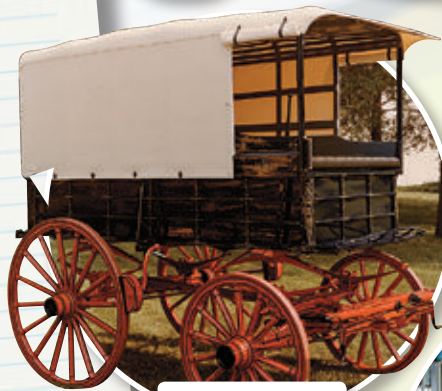
Horse-drawn wagons delivered goods in the 1900s.