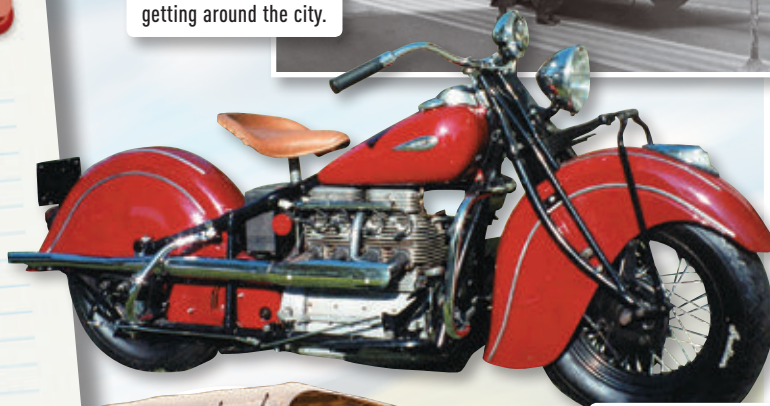
This 1941 Indian motorcycle turns heads even today.