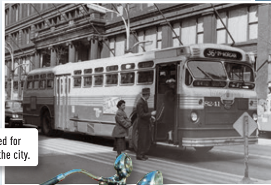
Buses are used for getting around the city.