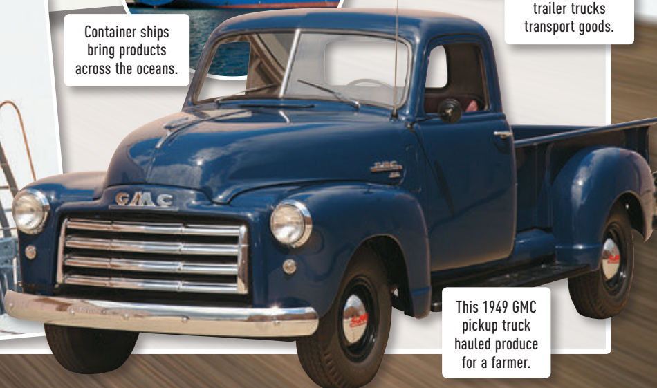
This 1949 GMC pickup truck hauled produce for a farmer.