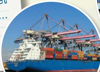
Container ships bring products across the oceans.