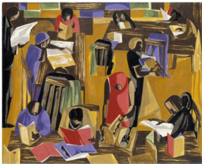
Jacob Lawrence, born 1917 The Library , 1960 tempera on fiberboard 60.9 x 75.8 cm (24 x 29 7/8 in.) National Museum of American Art, Smithsonian Institution, gift of S. C. Johnson and Son, Inc.

tions at the library. Performances and lectures were presented in the library's auditorium.