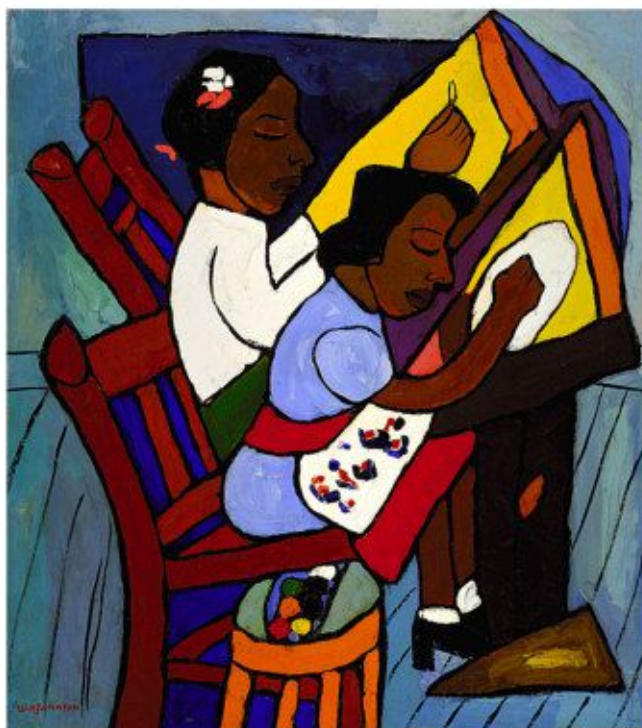
William H. Johnson, 1901–1970 Art Class , ca. 1939–1940 oil on plywood 83.5 x 73.6 cm (32 7/8 x 29 in.) National Museum of American Art, Smithsonian Institution, gift of the Harmon Foundation

2. Using the excerpt from The Negro Artist and the Racial Mountain , discuss the prejudices and triumphs African-American artists have experienced.