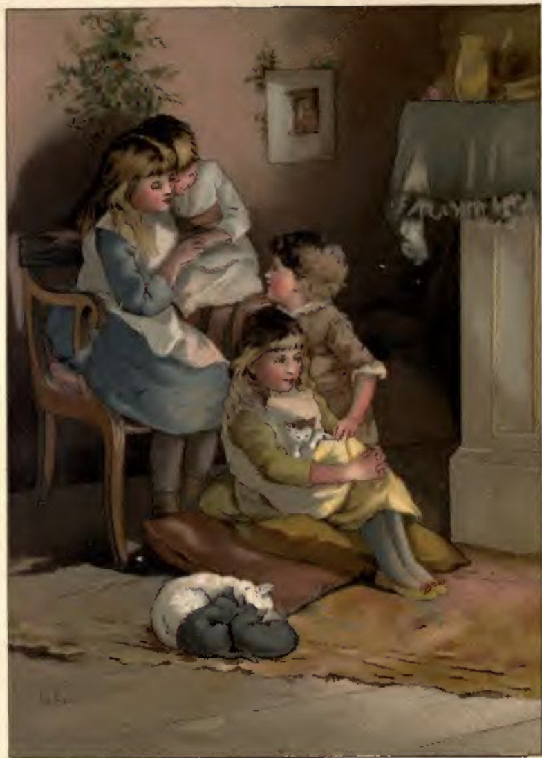
THE EVENING HOUR