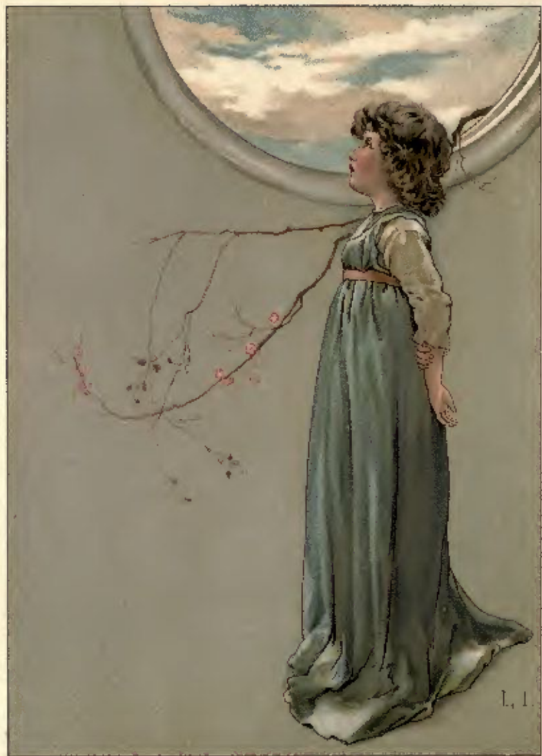
HOPES AND FEARS.