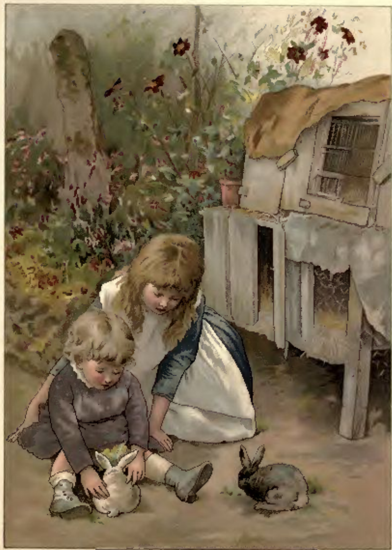
THE PET RABBIT