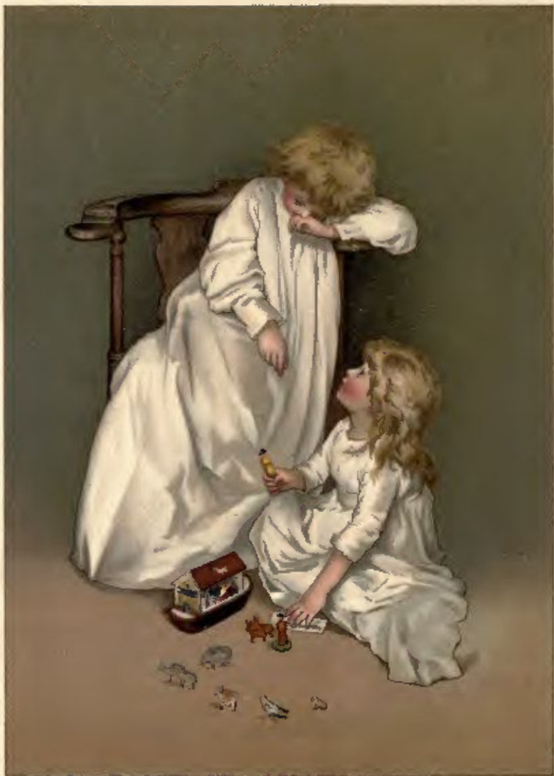
PUTTING AWAY THE TOYS.