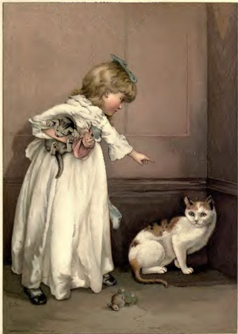
PUSS IN THE CORNER.