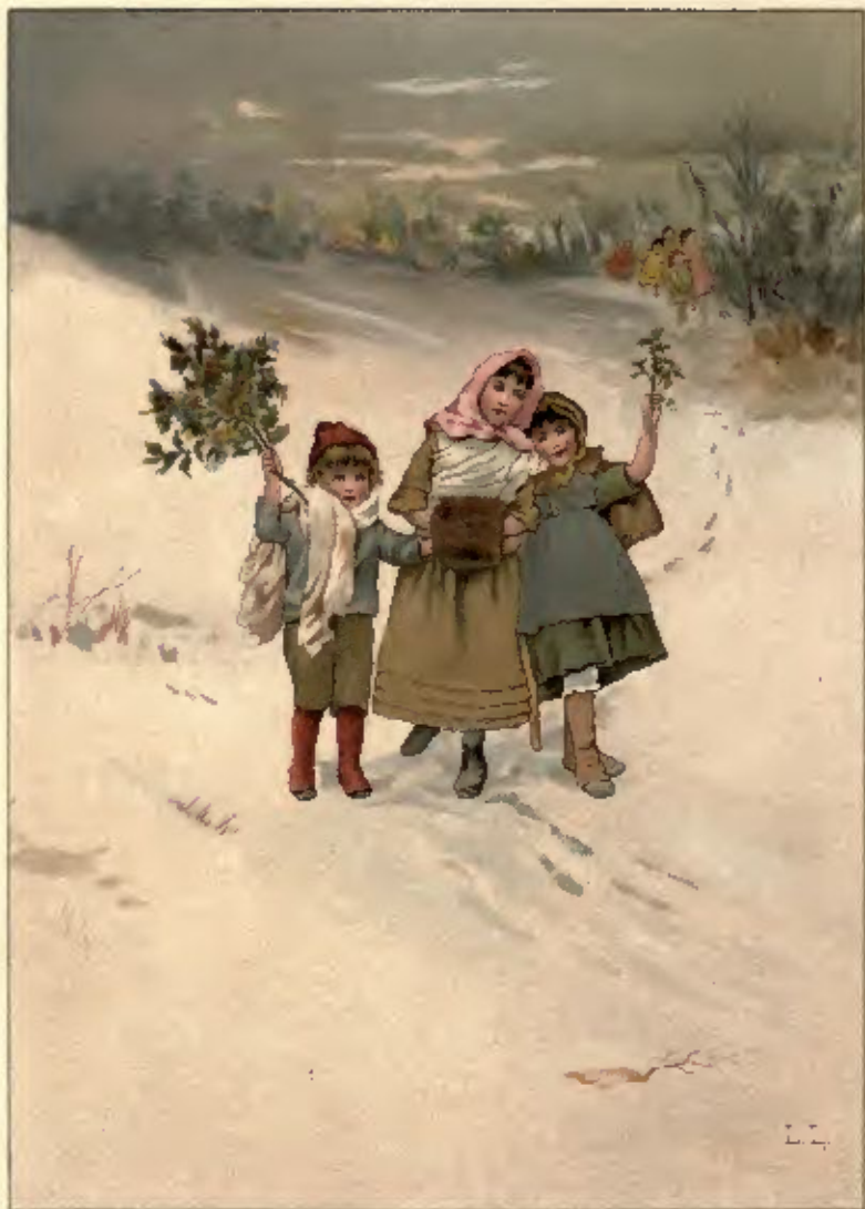
THE FOR CHRISTMAS