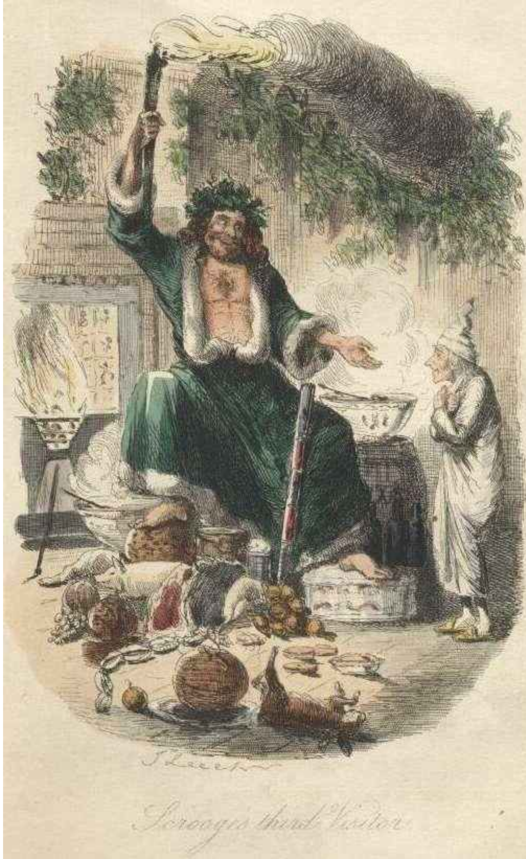
Scrooge's third visit