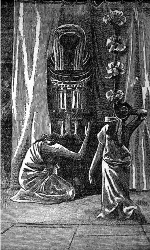
C. of B. Amense and Mysa Bewail the Death of Neco.—Page 175 .

Covered by white cloths it was placed on a sort of sledge. This was drawn by six of the attendants of the temple; Ameres and Chebron followed behind, and after them came a procession of priests. When it arrived at the house, Amense and Mysa, with their hair unbound and falling around them, received the body—uttering loud cries of lamentation, in which they