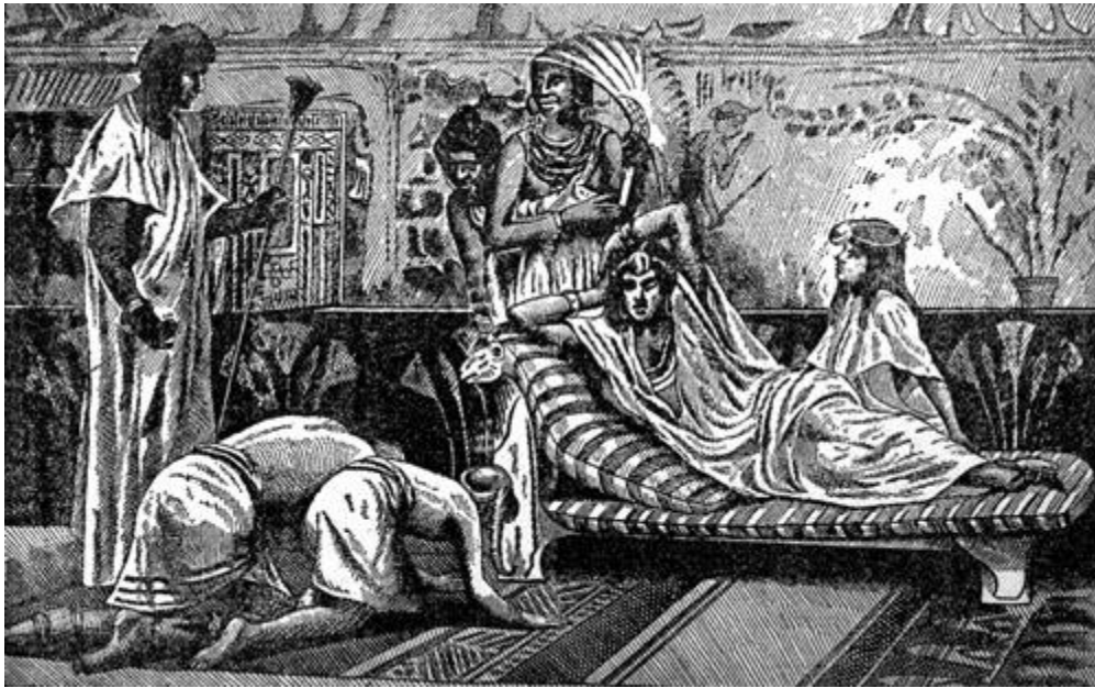
C. of B. The High-

Priest Presents Amuba and Jethro to his Wife.—