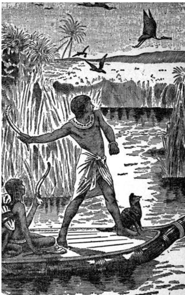
C. of B. Fowling with the Throwing-Stick.—

rushes were parted a little further, and the three shafts were loosed. The twangs of the bows startled the ducks, and stopping feeding they gazed at the rushes with heads on one side. Three more arrows glanced out, but this time one of the birds aimed at was wounded only, and uttering a cry of pain and terror it flapped along the surface of the water.