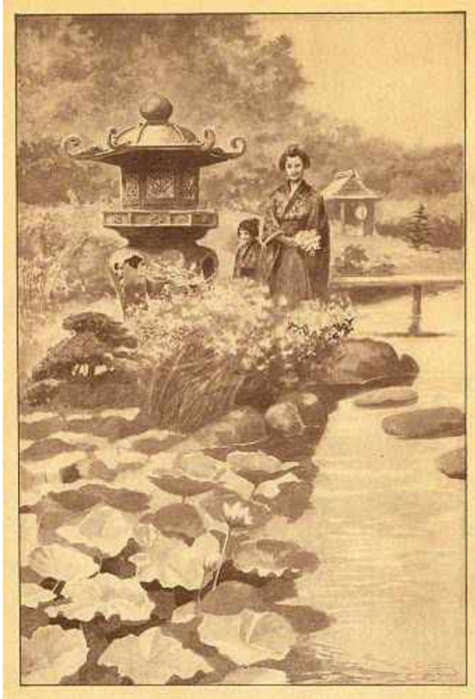
AUNT OCHO'S GARDEN.

After the butterfly show another man performs some wonderful tricks with a ladder. He places the ladder upright on the ground without any support; he climbs it, rung by rung, keeping its balance all the time. Finally he reaches the very top and stands on one foot, bowing and gracefully waving a fan. There is not time to tell you all the wonderful feats of the Japanese. Toyo and Lotus Blossom are delighted, although they have seen performances like these many times before.