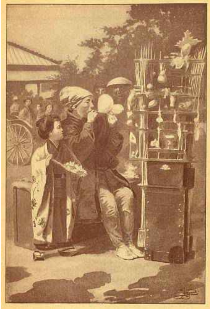
THE CANDY MAN.

But look! Here is a man standing in the middle of the street, dancing and singing a funny song. The sober Japanese who are passing stop and laugh. The man has a little stand by his side, and on this stand are a dish of wheat-gluten and a bamboo reed. As Lotus Blossom and Toyo draw near, the man ends his song and calls out, "Now who wants me to blow him a candy dog? Or shall it be a monkey eating a nut? You, my most honoured little lady, want one surely."