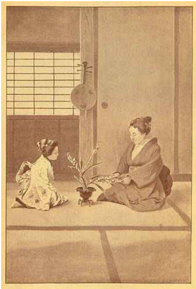
A LESSON IN ARRANGING FLOWERS.