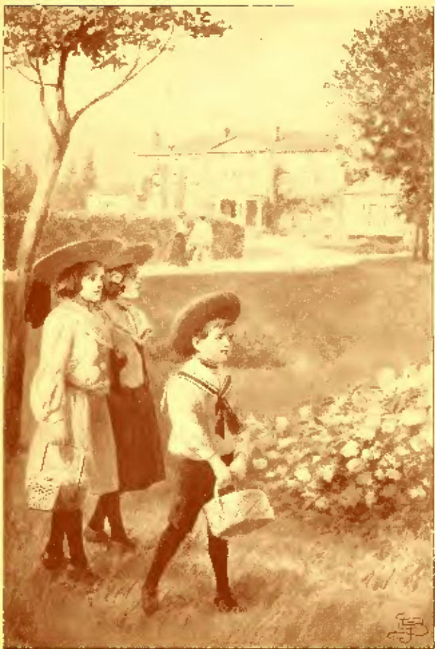
IN THE GOVERNMENT HOUSE GROUNDS