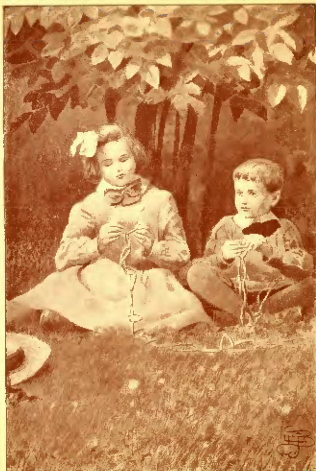
"TWO CHILDREN SAT ON THE GRASS UNDER THE LILACS" (See Page 2)