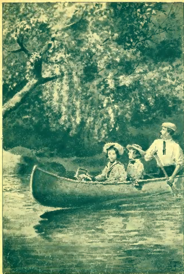
"THE TREE-CLAD SHORES WORE A FAIRY GLAMOUR"