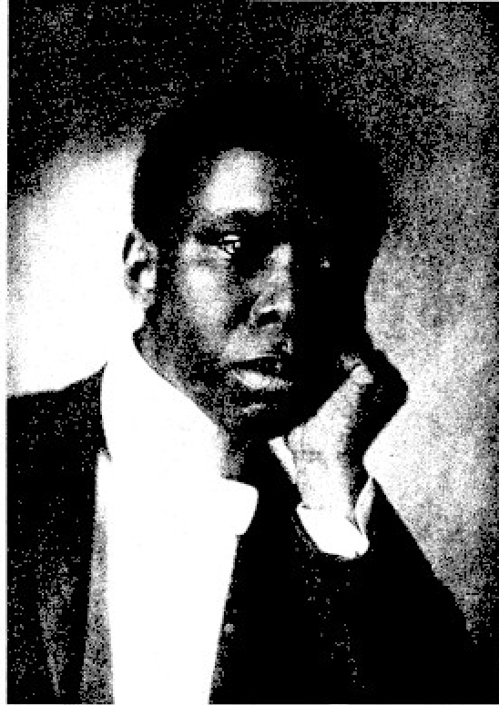
Paul Laurence Dunbar