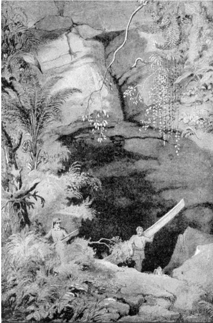
"CAME UNEXPECTEDLY ON A CAVERN."