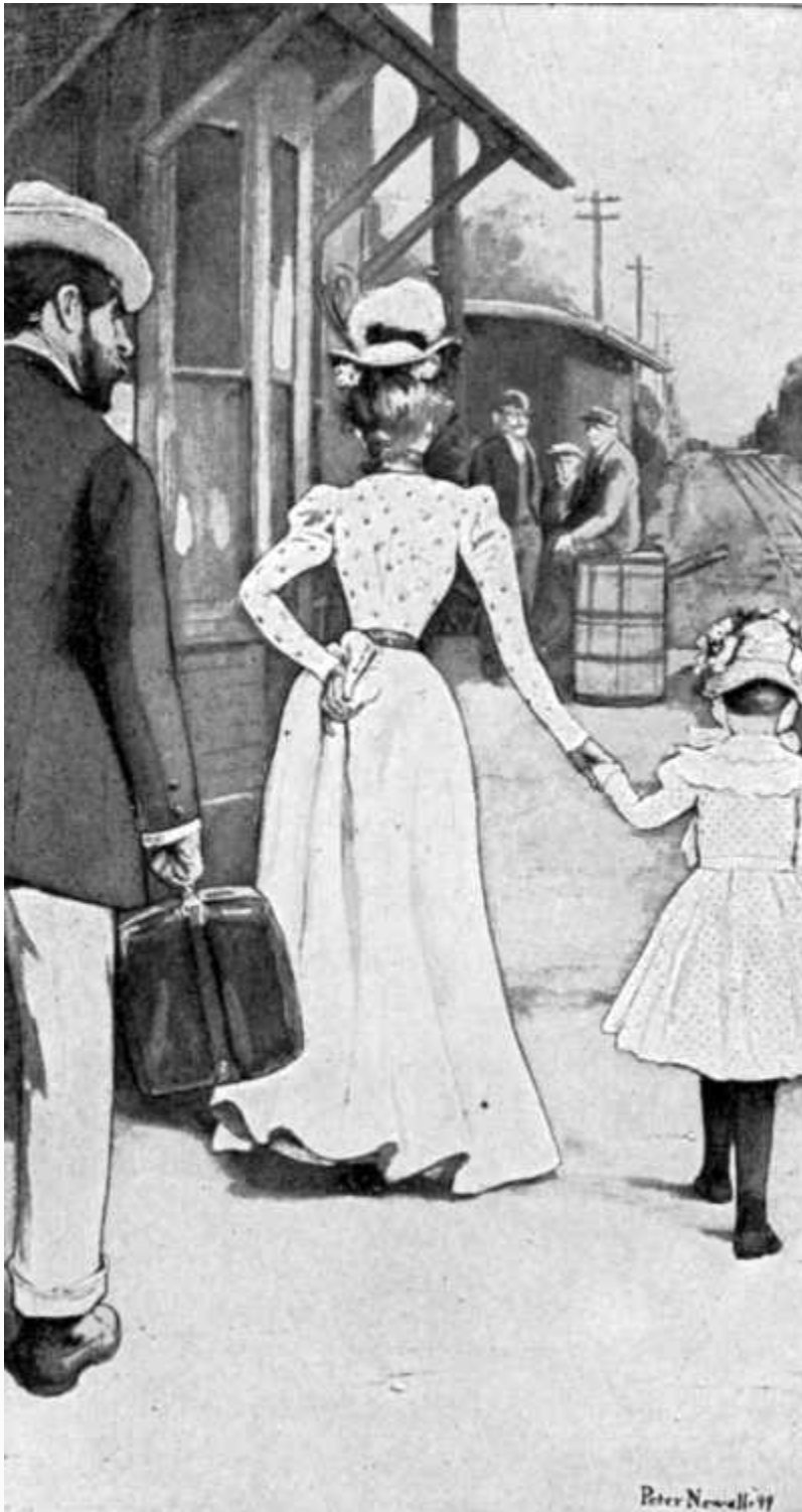
AT THE RAILWAY STATION