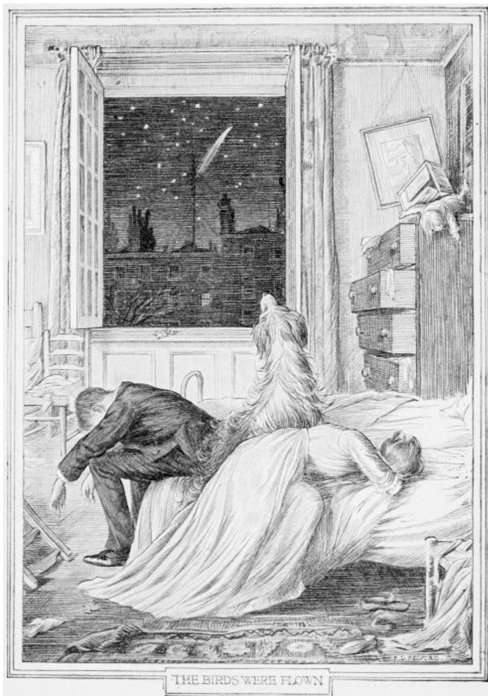
THE BIRDS WERE FLOWN

Mr. and Mrs. Darling and Nana rushed into the nursery too late. The birds were flown.