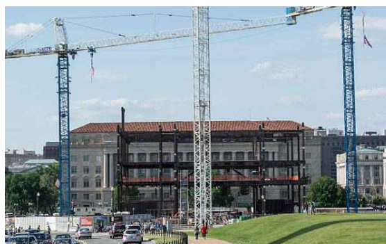
The museum under construction in May 2014.