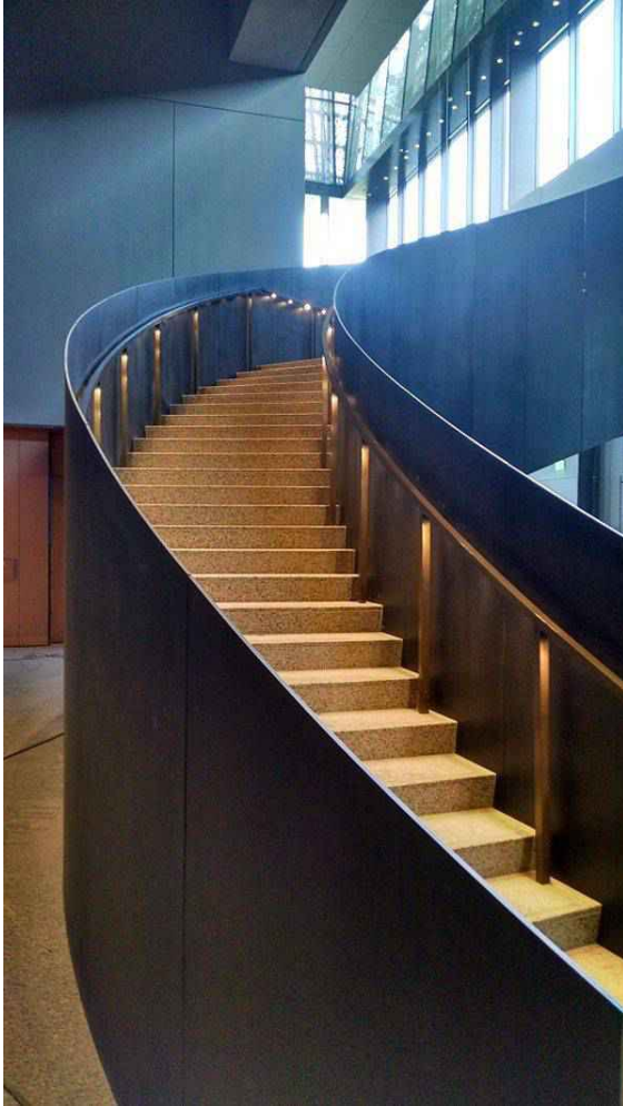
NMAAHC Monumental Stair

as liaison between the Smithsonian and public utilities and D.C. government agencies. [61]