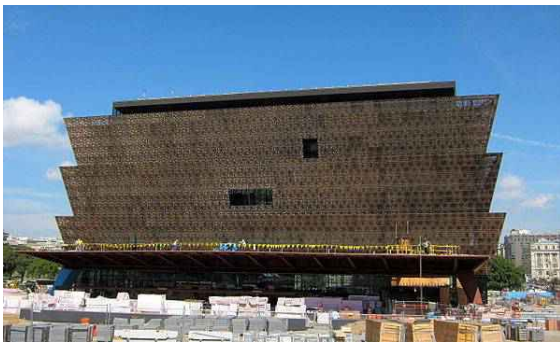
Construction in September 2015

as liaison between the Smithsonian and public utilities and D.C. government agencies. [61]