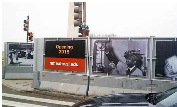
Construction signs at the future site of the National Museum of African American History and Culture in Washington, D.C.