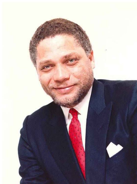
Rep. Mickey Leland, an early supporter of federal legislation for a black history museum.

and the arts in the black community. Emboldened by Congress's action in 1981, Mack began using the NCEED to press for a stand-alone African-American museum in D.C. in 1985. [4] Mack did not collaborate with other black-led cultural foundations that were working to improve the representation of African Americans by Smithsonian and other federal institutions. [5] Mack contacted Representative Mickey Leland about his idea for a national museum focusing on African Americans, and won his support for federal legislation in 1985. Leland sponsored a non-binding resolution (H.R. 666) advocating an African-American museum on the National Mall, which passed the House of Representatives in 1986. The congressional attention motivated the Smithsonian to improve its presentation of African-American history. In 1987, the National Museum of American History sponsored a major exhibit, "Field to Factory," which focused on the black diaspora out of the Deep South in the 1950s. [6]