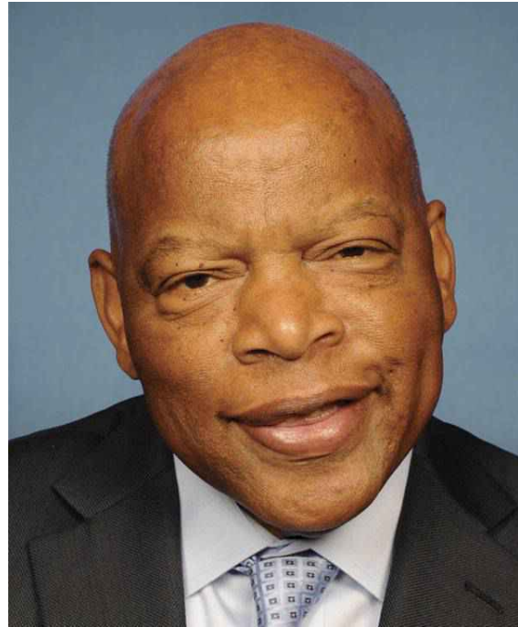
Rep. John R. Lewis, who championed the legislation for the museum after Rep. Leland's untimely death in 1989.