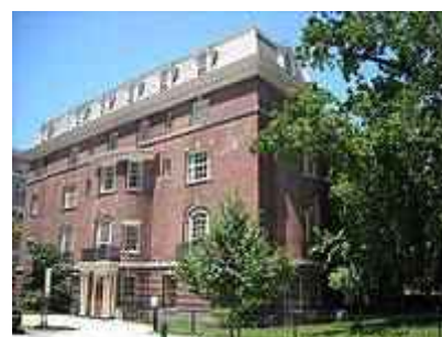
National Association of Colored Women headquarters in Washington, D.C.