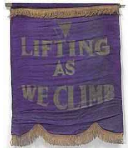
Banner with the National Association of Colored Women's Clubs' motto. Collection of the Smithsonian National Museum of African American History and Culture