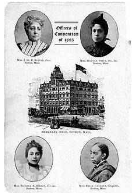
Officers of Convention of 1895. Historical Records of Conventions of 1895-96 of the Colored Women of America ( https://www.lib.uchicago.edu/ead/pdf/ibwells-0009-006.pdf )