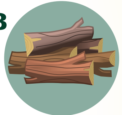
Firewood – larger, dry pieces of wood up to about 10" around.