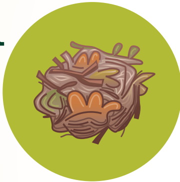
Tinder – small twigs, dry leaves or grass, dry needles.