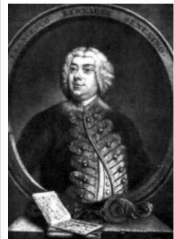
Senesino, the famous castrato from Siena

Handel introduced previously uncommon musical instruments in his works: the viola d'amore and violetta marina ( Orlando ), the lute ( Ode for St. Cecilia's Day ), three trombones (Saul), clarinets or small high cornetts ( Tamerlano ), theorbo, French horn ( Water Music ), lyrichord, double bassoon, viola da gamba, bell chimes, positive organ, and harp ( Giulio Cesare, Alexander's Feast ). [24]