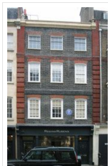
Handel House at 25 Brook Street, Mayfair, London

In May 1719, The 1st Duke of Newcastle, the Lord Chamberlain, ordered Handel to look for new singers. Handel travelled to Dresden to attend the newly built opera. He saw Teofane by Antonio Lotti, and engaged members of the cast for the Royal Academy of Music, founded by a group of aristocrats to assure themselves a constant supply of baroque opera or opera seria. Handel may have invited John Smith, his fellow student in Halle, and his son Johann Christoph Schmidt, to become his secretary and amanuensis. [13] By 1723 he had moved into a Georgian house at 25 Brook Street, which he rented for the rest of his life. This house, where he rehearsed, copied music and sold tickets, is now the Handel House Museum. [14] During twelve months between 1724 and 1725, Handel wrote three outstanding and successful operas, Giulio Cesare , Tamerlano and Rodelinda . Handel's operas are filled with da capo arias, such as Svegliatevi nel core . After composing Silete venti , he concentrated on opera and stopped writing cantatas. Scipio , from which the regimental slow march of the British Grenadier Guards is derived, was performed as a stopgap, waiting for the arrival of Faustina Bordoni.