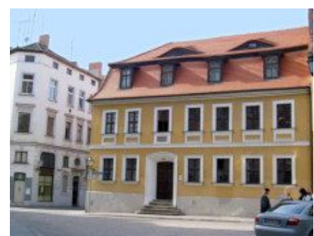
Händel-Haus (2009) – birthplace of George Frideric Handel