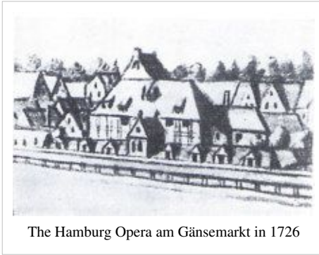
The Hamburg Opera am Gänsemarkt in 1726

In 1702, following his father's wishes, Handel started studying law under Christian Thomasius at the University of Halle. He earned an appointment for one year as the organist in the former cathedral, by then an evangelical reformed church. Handel seems to have been unsatisfied, and in 1703 he accepted a position as violinist and harpsichordist in the orchestra of the Hamburg Oper am Gänsemarkt. There he met the composers Johann Mattheson, Christoph Graupner and Reinhard Keiser. His first two operas, Almira and Nero , were produced in 1705. He produced two other operas, Daphne and Florindo , in 1708. It is unclear whether Handel directed these