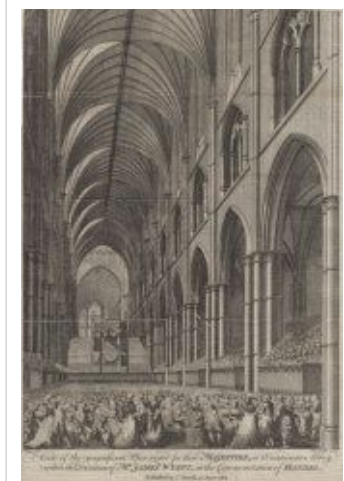
Handel Commemoration in Westminster Abbey, 1784

After Handel's death, many composers wrote works based on or inspired by his music. The first movement from Louis Spohr's Symphony No. 6 , Op. 116, "The Age of Bach and Handel", resembles two melodies from Handel's Messiah . In 1797 Ludwig van Beethoven published the 12 Variations in G major on 'See the conqu'ring hero comes' from Judas Maccabaeus by Handel , for cello and piano. In 1822 Beethoven composed The Consecration of the House overture, which also bears the influence of Handel. Guitar virtuoso Mauro Giuliani composed his Variations on a Theme by Handel , Op. 107 for guitar, based on Handel's Suite No. 5 in E major, HWV 430, for harpsichord. In 1861, using a theme from the second of Handel's harpsichord suites, Johannes Brahms wrote the Variations and Fugue on a Theme by Handel , Op. 24, one of his most successful works (praised by Richard Wagner). Several works by the French composer Félix-Alexandre Guilmant use Handel's themes, for example his March on a Theme by Handel uses a theme from Messiah . French composer and flautist Philippe Gaubert wrote his Petite marche for flute and piano based on the fourth movement of Handel's Trio Sonata, Op. 5, No. 2, HWV 397. Argentine composer Luis Gianneo composed his Variations on a Theme by Handel for piano. In 1911, Australian-born composer and pianist Percy Grainger based one of his most famous works on the final movement of Handel's Suite No. 5 in E major (just like Giuliani). He first