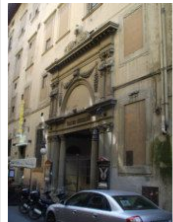
Entrance of Teatro del Cocomero in Florence