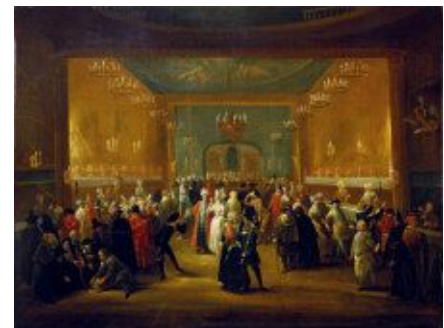
A Masquerade at the King's Theatre, Haymarket (c. 1724)

Recent decades have revived his secular cantatas and what one might call 'secular oratorios' or 'concert operas'. Of the former, Ode for St. Cecilia's Day (1739) (set to texts by John Dryden) and Ode for the Birthday of Queen Anne