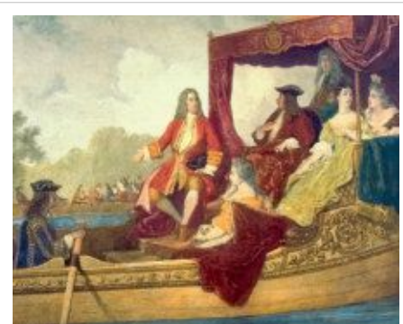
George Frideric Handel (left) and King George I on the River Thames, 17 July 1717, by Edouard Hamman (1819–88).

The conception of an opera as a coherent structure was slow to capture Handel's imagination and he composed no operas for five years. In July 1717 Handel's Water Music was performed more than three times on the Thames for the