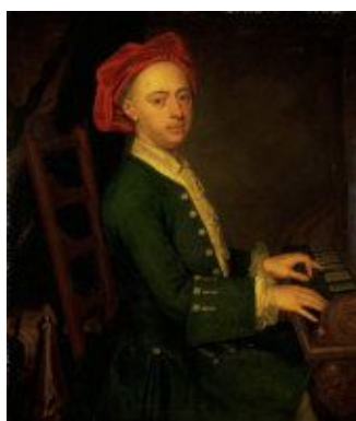
The Chandos portrait. The 1st Duke of Chandos was an important patron for Handel.

In 1717 Handel became house composer at Cannons in Middlesex, where he laid the cornerstone for his future choral compositions in the twelve Chandos Anthems . [10] Romain Rolland stated that these anthems were as important for his oratorios as the cantatas were for his operas. [11] Another work he wrote for The 1st Duke of Chandos, the owner of Cannons, was Acis and Galatea : during Handel's lifetime it was his most performed work. Winton Dean wrote, "the music catches breath and disturbs the memory".