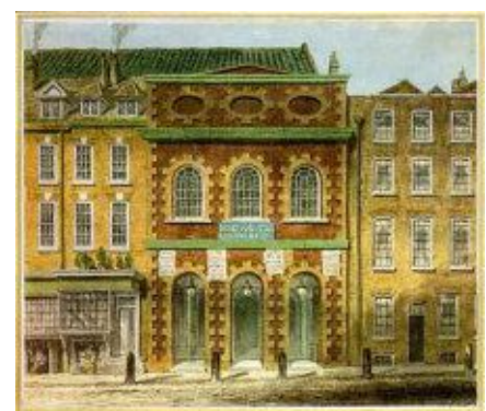
The Queen's Theatre in the Haymarket in London by William Capon