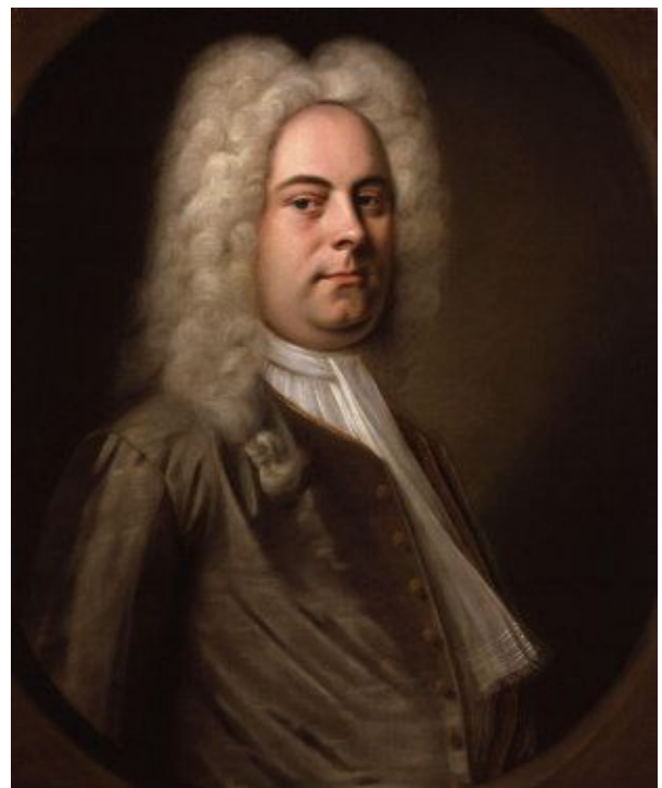
George Frideric Handel, born in 1685, the same year as Johann Sebastian Bach and Domenico Scarlatti. By Balthasar Denner (c. 1726–1728)

Handel is regarded as one of the greatest composers of the Baroque era, with works such as Water Music , Music for the Royal Fireworks and Messiah remaining popular. [3] One of his four Coronation Anthems, Zadok the Priest (1727), composed for the coronation of George II of Great Britain, has been performed at every subsequent British coronation, traditionally during the sovereign's anointing. Handel composed more than forty operas in over thirty years, and since the late 1960s, with the revival of baroque music and historically informed musical performance, interest in Handel's operas has grown.