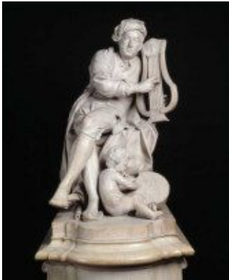
A carved marble statue of Handel, created in 1738 by Louis-François Roubiliac

(1713) are noteworthy. For his secular oratorios, Handel turned to classical mythology for subjects, producing such works as Acis and Galatea (1719), Hercules (1745) and Semele (1744). These works have a close kinship with the sacred oratorios, particularly in the vocal writing for the English-language texts. They also share the lyrical and dramatic qualities of Handel's Italian operas. As such, they are sometimes performed onstage by small chamber ensembles. With the rediscovery of his theatrical works, Handel, in addition to his renown as instrumentalist, orchestral writer, and melodist, is now perceived as being one of opera's great musical dramatists.