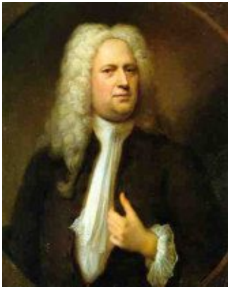
George Frideric Handel in 1733, by Balthasar Denner (1685–1749)

In 1749 Handel composed Music for the Royal Fireworks ; 12,000 people attended the first performance. In 1750 he arranged a performance of Messiah to benefit the Foundling Hospital. The performance was considered a great success and was followed by annual concerts that continued throughout his life. In recognition of his patronage, Handel was made a governor of the Hospital the day after his initial concert. He bequeathed a copy of Messiah to the institution upon his death. His involvement with the Foundling Hospital is today commemorated with a permanent exhibition in London's Foundling Museum, which also holds the Gerald Coke Handel Collection . In addition to the Foundling Hospital, Handel also gave to a charity that assisted impoverished musicians and their families.