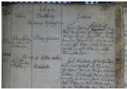
Handel's baptismal registration (Marienbibliothek in Halle)