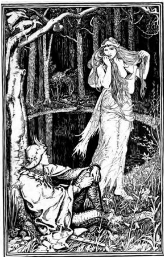
THE WITCH-MAIDEN SEES THE YOUNG MAN UNDER A TREE