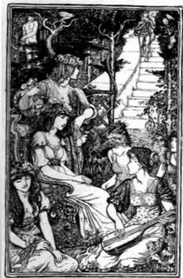
Philiza & her maidens in the garden