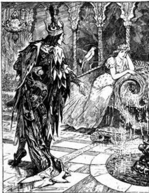
The Wizard King pays a visit to the Princess

indulge in hope, for she had recognised the likeness of herself which her mother always wore.