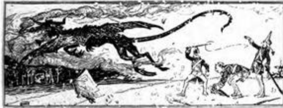
The Fiend defeated

Then the Dragon flew away with a loud shriek, and had no more power over them. But the three soldiers took the little whip, whipped as much money as they wanted, and lived happily to their lives' end.