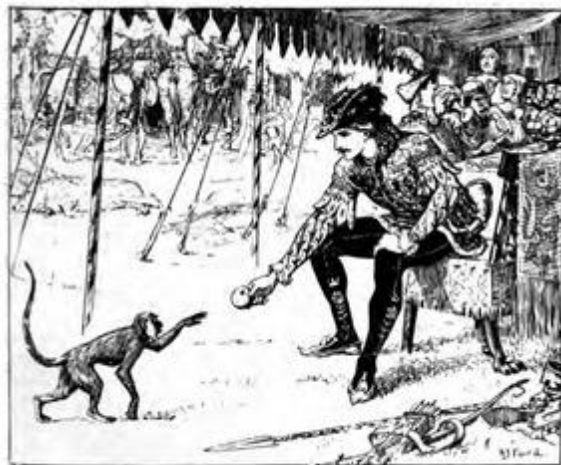
The King makes friends with the Green Monkey

The Queen, whose ambition was boundless, was delighted to see the crown on her son's head and to have the power in her own hands. Her hard rule made her very unpopular, and it was commonly believed that she had made away with Prince Alphege. Indeed, had the King her son not been deservedly beloved a revolution would certainly have arisen.