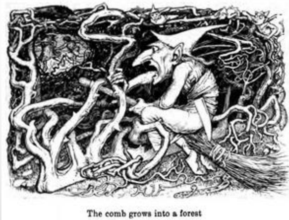
The comb grows into a forest

When the witch came up to it, it took her a long time before she found a place which she could ford over on her broom-stick; but at last she got across, and continued the chase faster than before. And as the children ran they heard a sound, and the little sister put her ear to the ground, and heard the broom sweeping the earth close behind them; so, quick as thought, she threw the comb down on the ground, and in an instant, as the cat had said, a dense forest sprung up, in which the roots and branches were so closely intertwined, that it was impossible to force a way through it. So when the witch came up to it on her broom she found that there was nothing for it but to turn round and go back to her hut.