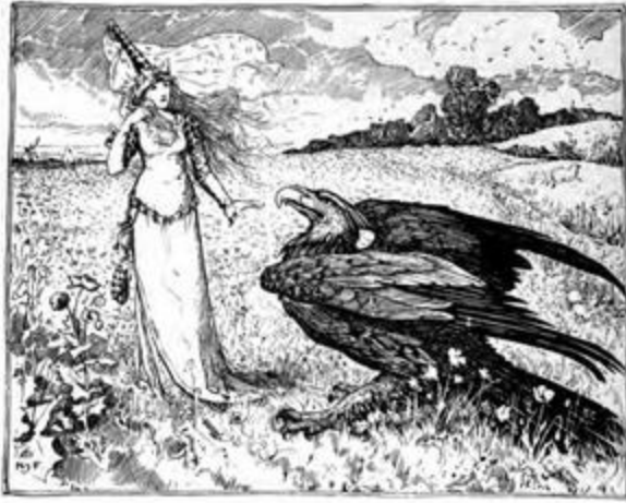
The Princess and the eagle in the flowery meadow

The King retorted that her opposition filled him with despair, but that he hoped to carry her to a place where all around would respect her, and where every pleasure would surround her. So saying, he seized her once more, and in spite of all her cries he rapidly bore her off to the neighbourhood of his capital. Here he gently placed her on a lawn, and as he did so she saw a magnificent palace spring up at her feet. The architecture was imposing, and in the interior the rooms were handsome and furnished in the best possible taste.