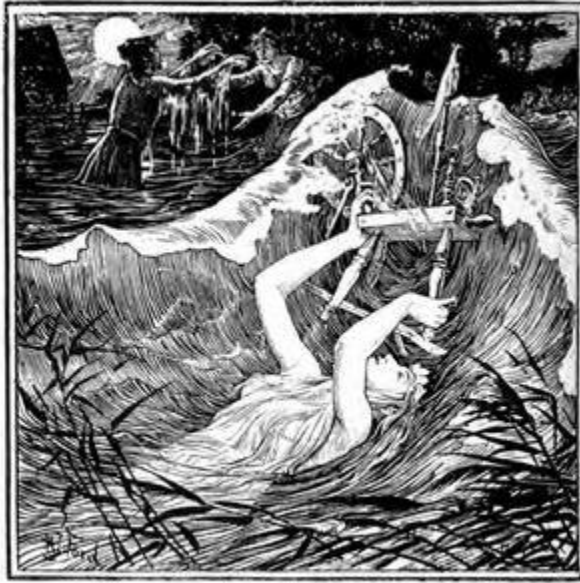
'A wave swept the spinning-wheel from the bank.'

hunter and the hunter's wife found themselves each in a strange country, and neither knew what had become of the other.