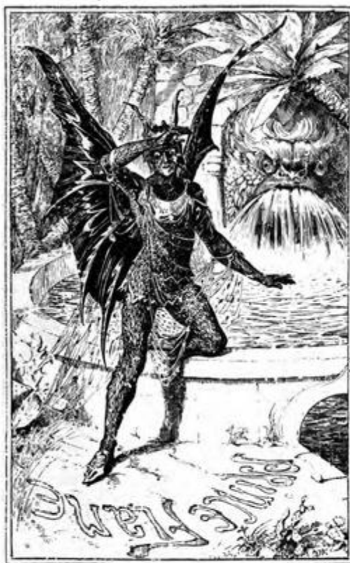
PRINCE ONOME LEARNS THE NAME OF HIS RIVAL AT THE GOLDEN FOUNTAIN