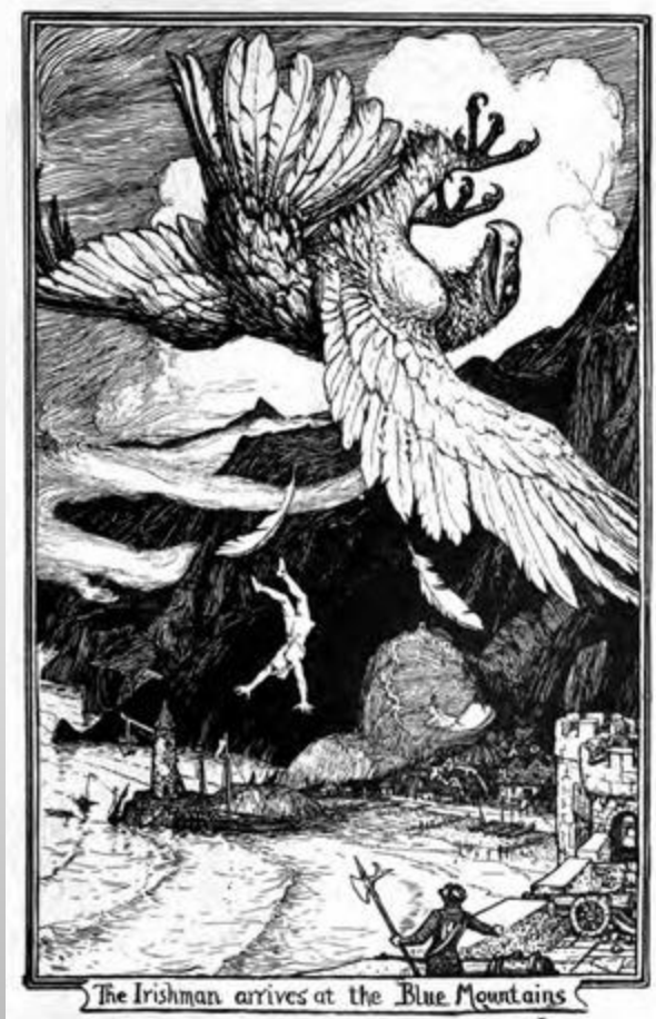
The Irishman arrives at the Blue Mountains