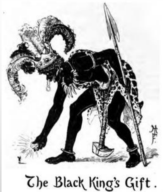
The Black King's Gift .

So the Hazel-nut child and his parents lived in happiness and prosperity after this till they died.