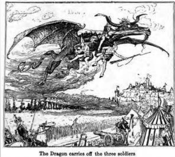
The Dragon carries off the three soldiers

they lived in merrymaking and splendour, drove about with horses and carriages, ate and drank, but did nothing wrong.