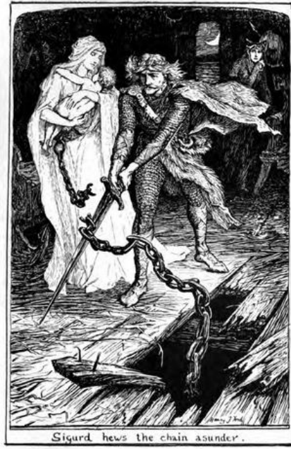
Sigurd hews the chain asunder.

returned by the same way as she had come, and the floor closed over her again. Although the woman had not spoken a single word to her, the nurse was very much frightened, but told no one about it.