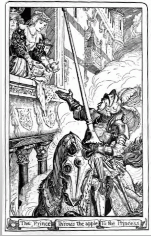
The Prince Throws the apple To the Princess