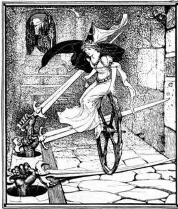
'Then she reached the three cutting swords, and got on her plough-wheel and rolled over them'

In the evening, when she had washed up and was ready, she felt in her pocket and found the three nuts which the old toad had given her. She cracked one and was going to eat the kernel, when behold! there was a beautiful royal dress inside it! When the