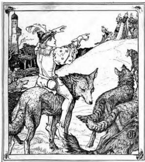
Ferko leads the wolves on.

But the wolf on whose back Ferko sat, said to its rider, 'Go on! go on!' and at the same moment many more wolves ran up the hill, howling horribly and showing their white teeth.