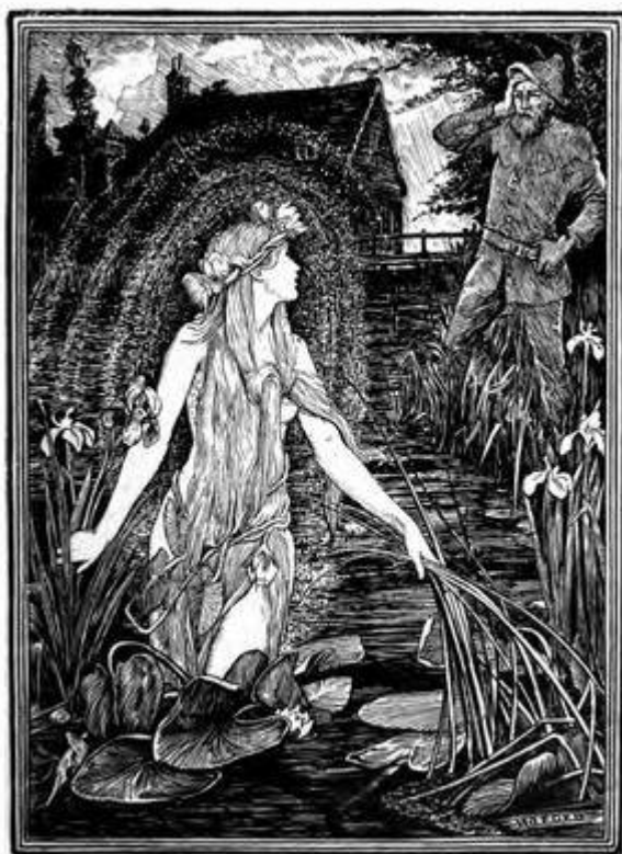
The miller sees the nixy of the mill pond