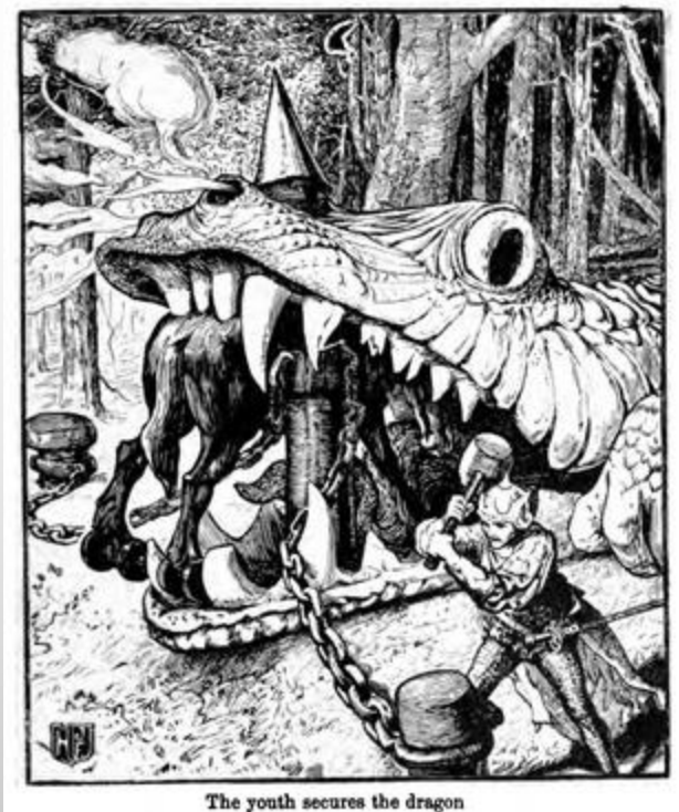
The youth secures the dragon

The young man thanked the magician for his directions, and promised, should they succeed, to reward him. But the magician answered, 'I have profited so much by the wisdom the ring has taught me that I desire no other reward.' Then they parted, and the youth quickly flew home through the air. After remaining in his own home for