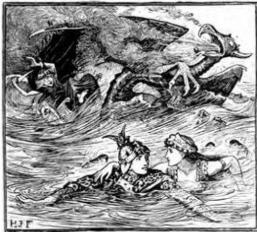
'But the waters seized her chariot and sunk it in the lowest depths'

While he was gazing on it and wondering what it could mean, he heard the sweeping of wings above him, and looking up he saw a huge vulture with open claws swooping down upon him. In a moment he seized the egg and flung it at the bird with all his might, and lo and behold! instead of the ugly monster the most beautiful girl he had ever seen stood before the astonished eyes of the Prince.