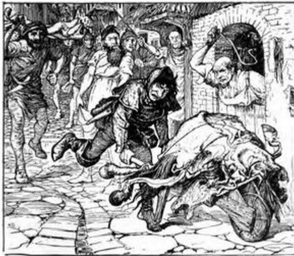
The shoemakers and tanners drive Big Klaus out of the town

Little Klaus' grandmother had just died. Though she had been very unkind to him, he was very much distressed, and he took the dead woman and laid her in his warm bed to try if he could not bring her back to life. There she lay the whole night, while he sat in the corner and slept on a chair, which he had often done before. And in the night as he sat there the door opened, and Big Klaus came in with his axe. He knew quite well where Little Klaus's bed stood, and going up to it he struck the grandmother on the head just where he thought Little Klaus would be. 'There!' said he. 'Now you won't get the best of me again!' And he went home.