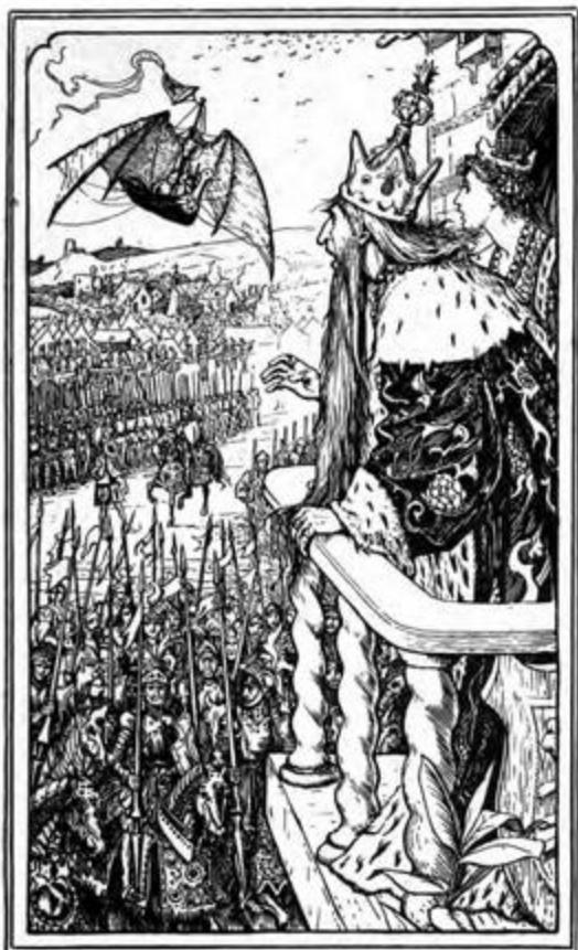
SIMPLINGTON'S ARMY APPEARS BEFORE THE KING