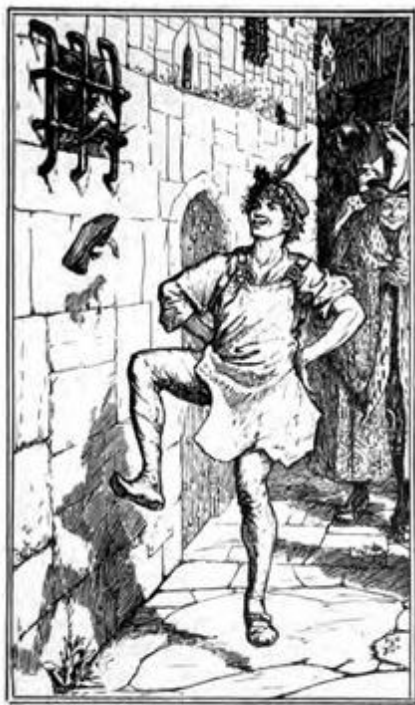
'He was skipping along so merrily'

There he sat. Oh, how dark and dull it was there! And they told him: 'To-morrow you are to be hanged.' Hearing that did not exactly cheer him, and he had left his tinder-box in the inn.