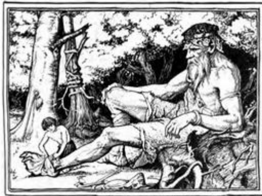
The Herd-boy binds up the Giant's foot.

There was once upon a time a poor boy who had neither father nor mother. In order to gain a living he looked after the sheep of a great Lord. Day and night he spent out in the open fields, and only when it was very wet and stormy did he take refuge in a little hut on the edge of a big forest. Now one night, when he was sitting on the grass beside his flocks, he heard not very far from him the sound as of some one crying. He rose up and followed the direction of the noise. To his dismay and astonishment he found a Giant lying at the entrance of the wood; he was about to run off as fast as his legs could carry him, when the Giant called out: 'Don't be afraid, I won't harm you. On the contrary, I will reward you handsomely if you will bind up my foot. I hurt it when I was trying to root up an oak-tree.' The Herd-boy took off his shirt, and bound up the Giant's wounded foot with it. Then the Giant rose up and said, 'Now come and