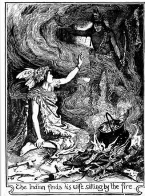
The Indian finds his wife sitting by the fire.

you died. Let us now go back to our tribe. Then you will be well, and I can touch you.'