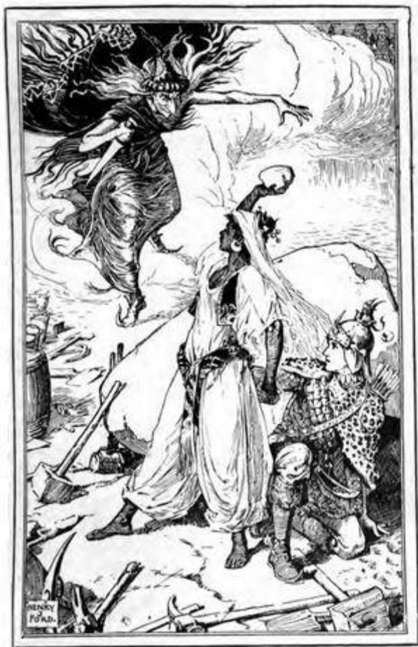
THE BLACK GIRL STOPS THE WITCH WITH A BIT OF THE ROCK