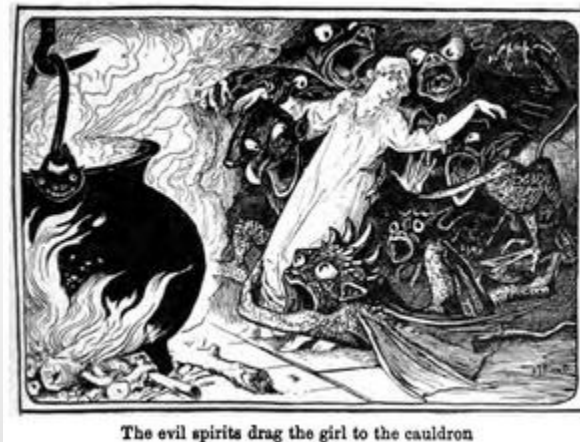
The evil spirits drag the girl to the cauldron

Now one of the Princess's elder sisters, who was very inquisitive, had found out about everything, and went to pay her youngest sister a visit in the ruined castle. She implored her so urgently to let her spend the night with her in the golden bed, that at last the good-natured little Princess consented. But at midnight, when the odd folk appeared, the elder sister screamed with terror, and from this time on the youngest Princess insisted always on keeping watch alone.