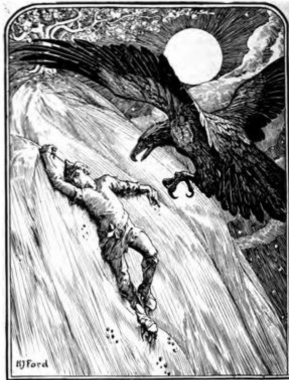
The boy attacked by the eagle on the Glass Mountain

It was almost pitch dark now, and only the stars lit up the Glass Mountain. The poor boy still clung on as if glued to the glass by his blood-stained hands. He made no