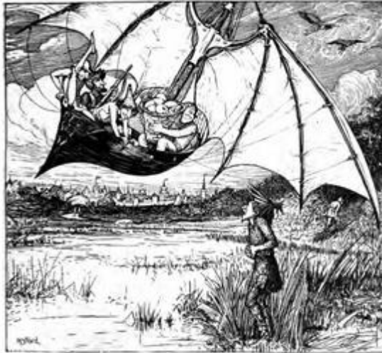
The comrades in the flying ship meet the drinker

And so the mighty drinker was added to the company; and the ship flew farther, and even farther, till again the Simpleton looked out, and this time he saw a man dragging a bundle of wood, walking through the forest beneath them.