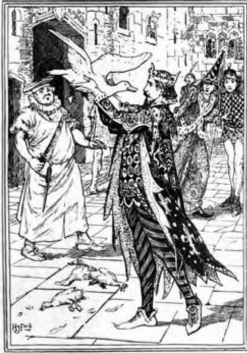
The King catches the White Duck

'Quack, quack—my little loves! Quack, quack—my turtle-doves! I brought you up with grief and pain, And now before my eyes you're slain. I gave you always of the best; I kept you warm in my soft nest. I loved and watched you day and night— You were my joy, my one delight.'