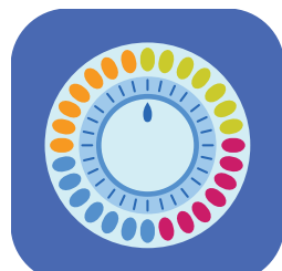
Birth Control Pill