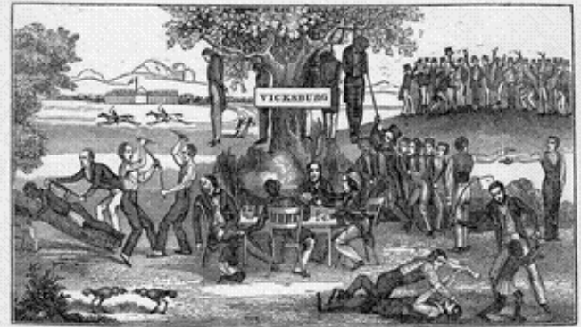
"Our Peculiar Domestic Institu