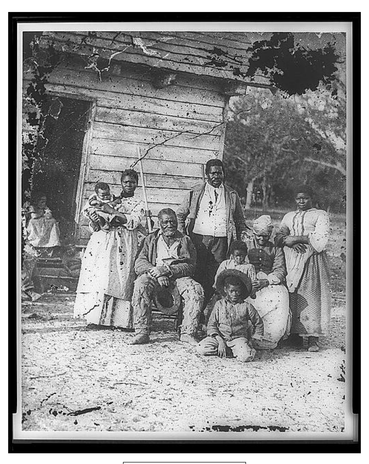
Group One Primary Source Set Primary Source #2 of 3