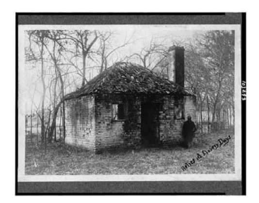
Relics of slavery days

Library of Congress Bibliographic record: <a href="http://hdl.loc.gov/loc.pnp/cph.3c03293">http://hdl.loc.gov/loc.pnp/cph.3c03293</a>