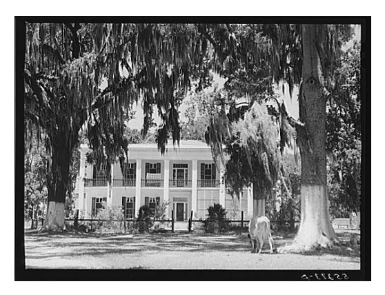
Old Jackson Plantation home, owned by a sugarcane planter

Library of Congress Bibliographic record: <a href="http://hdl.loc.gov/loc.pnp/cph.3c03293">http://hdl.loc.gov/loc.pnp/cph.3c03293</a>