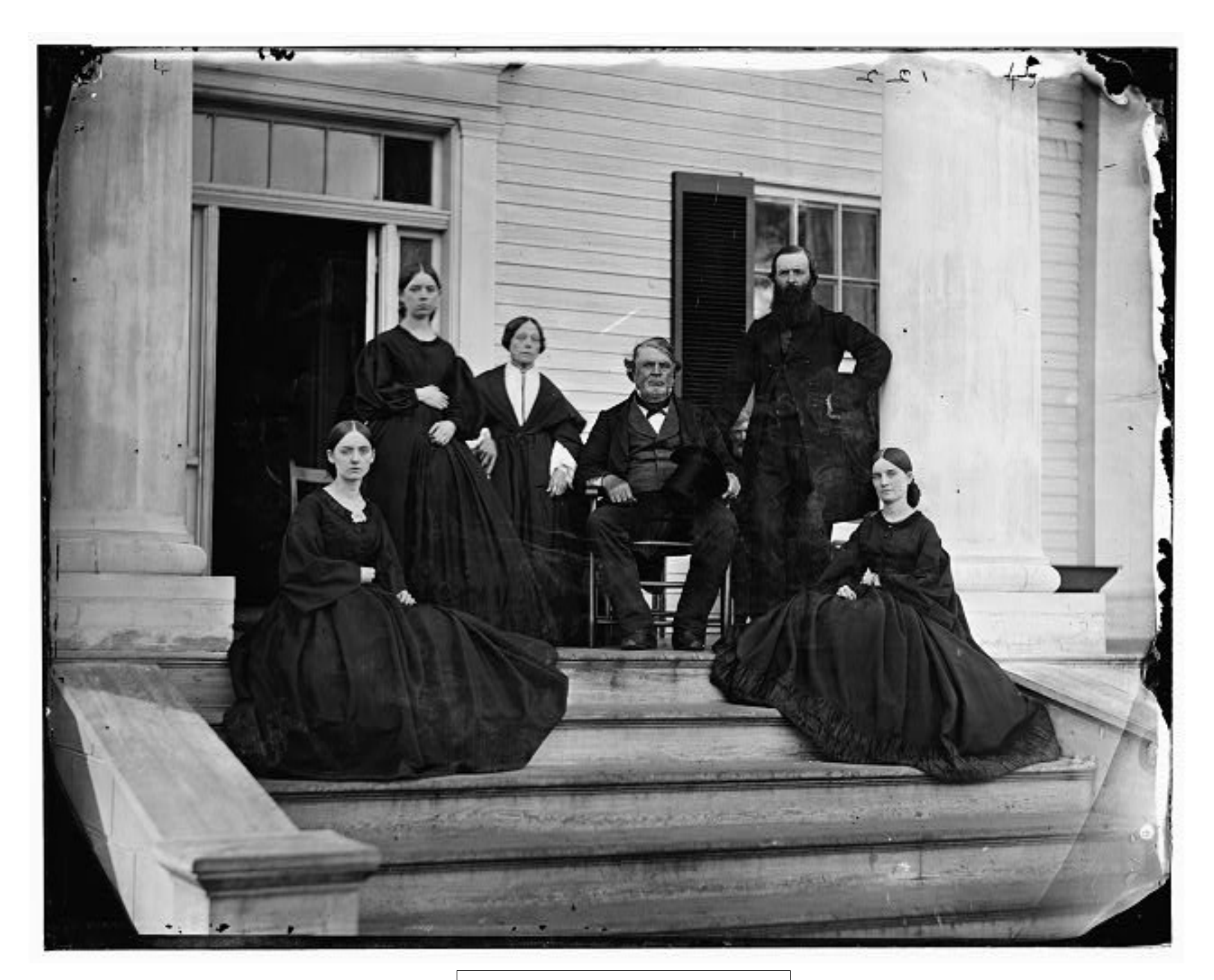
Group One Primary Source Set Primary Source #1 of 3